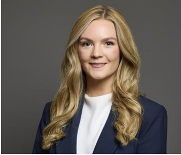
Kate Dearden MP Minister for Employment Rights and Consumer Protection