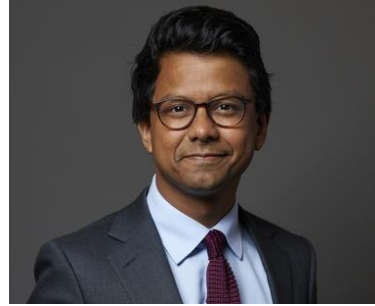
Kanishka Narayan MP Minister for AI and Online Safety