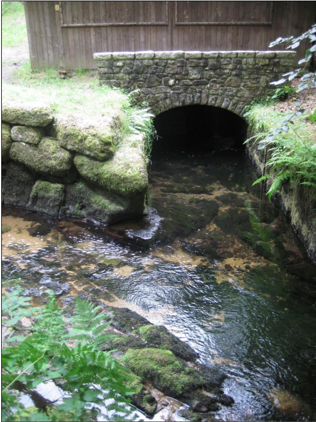
Photograph 10- Tailrace from Turbine/Generator House and discharge point to the West Webburn River