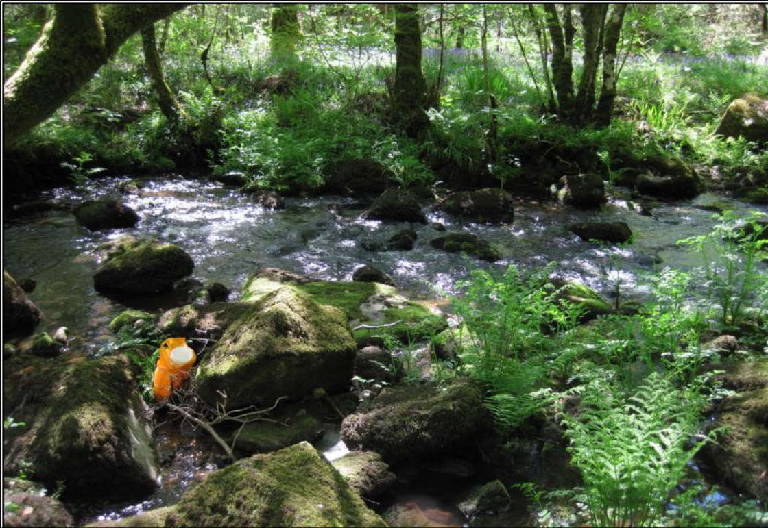
Photograph 7: Deprived reach on West Webburn River (May 2018)