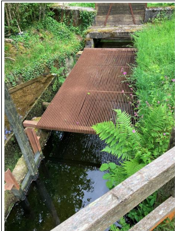
Photograph 4: Screen by Sluice gate