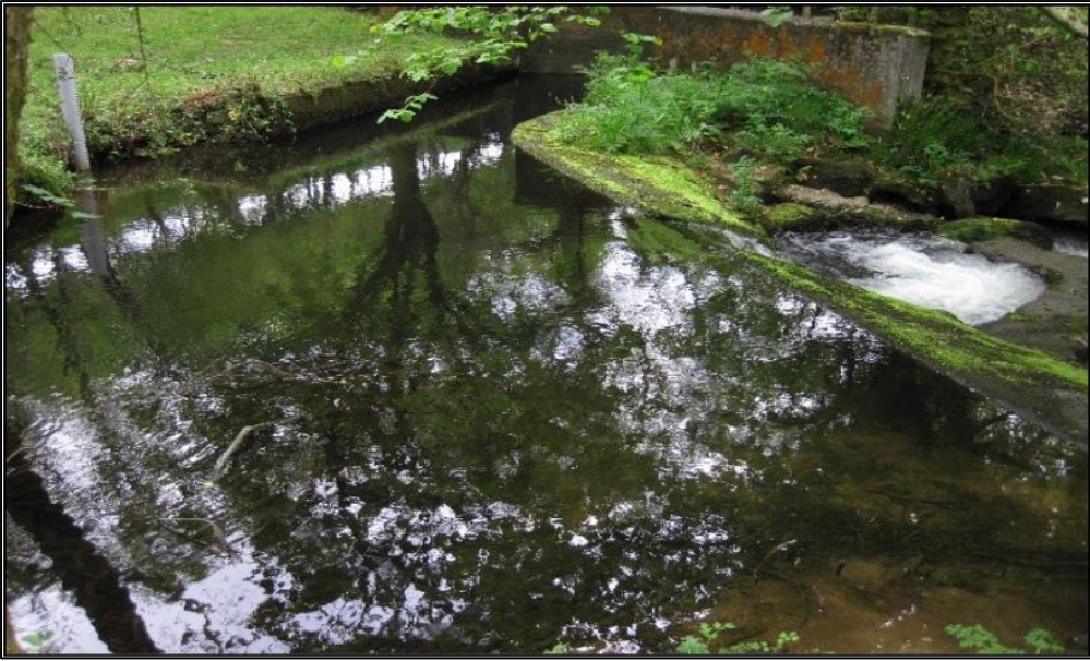
Photograph 1: Looking downstream to the leat, sluice gate and weir (May 2018)