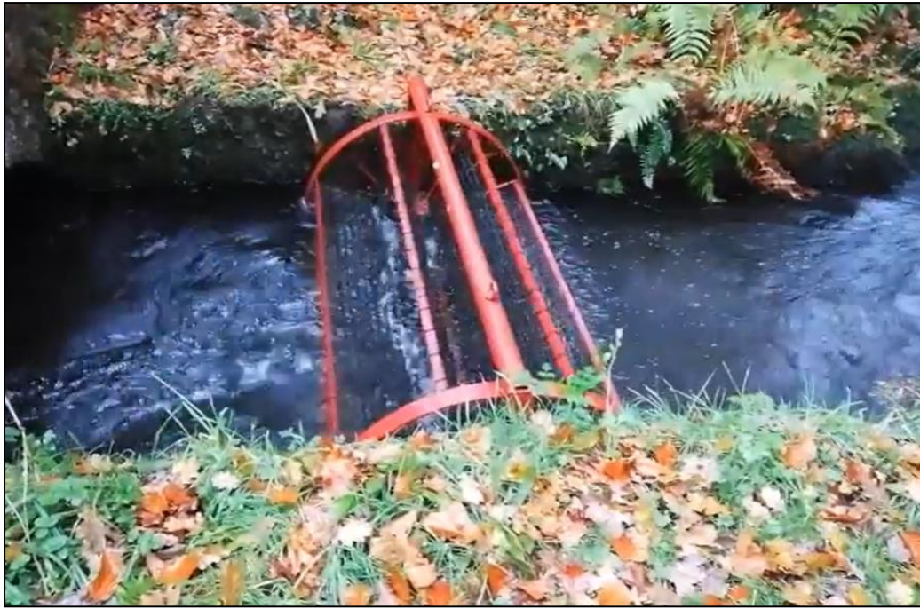
Photograph 9: Rotating drum screen in tail race