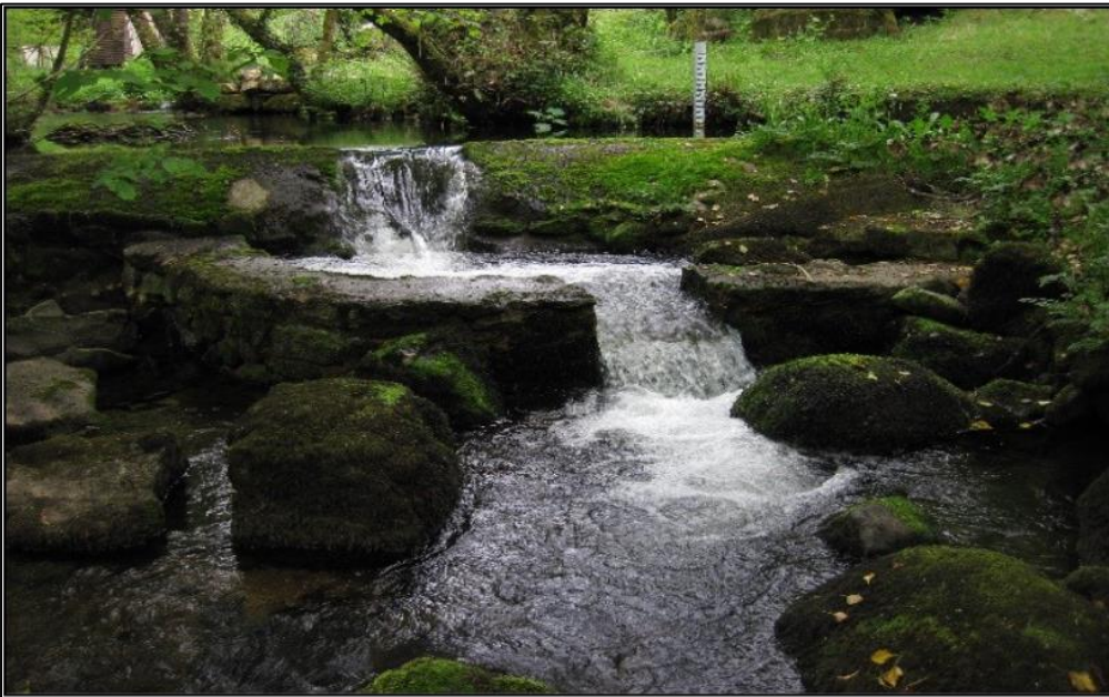
Photograph 2: Looking upstream to the weir and fish pass on the West Webburn River (May 2018)