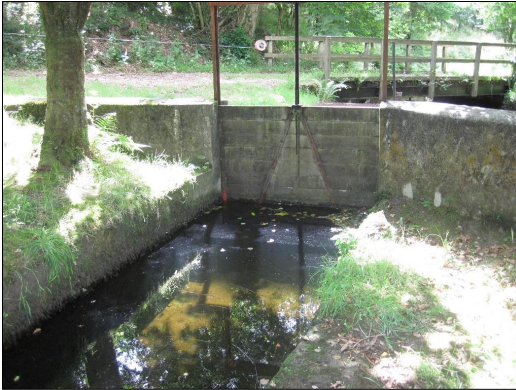
Photograph 3: Sluice Gate (Summer 2018)