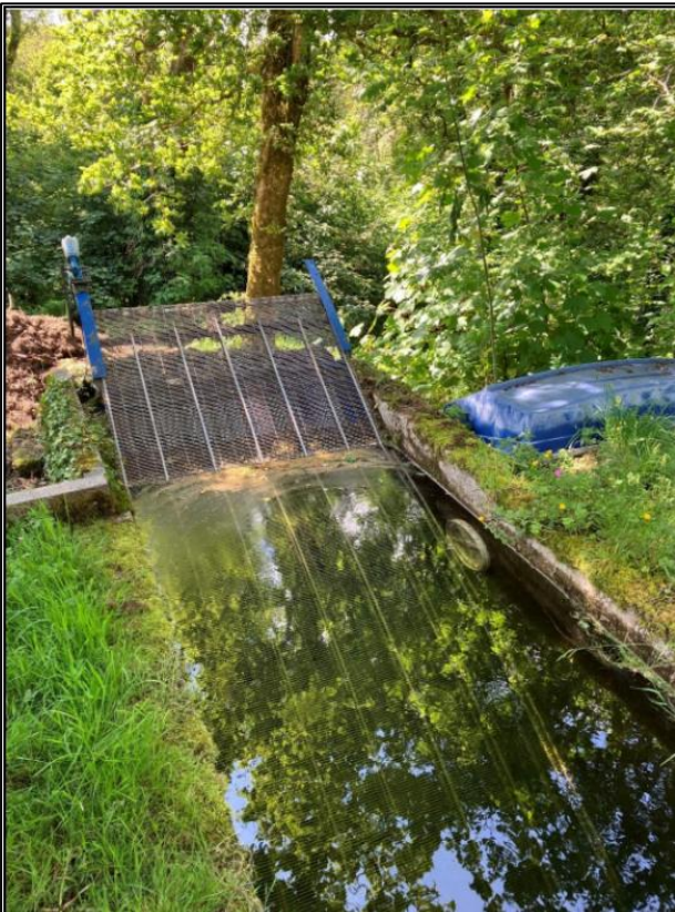
Photograph 6: Existing screen and bywash entrance (at low leaf flows) June 2024