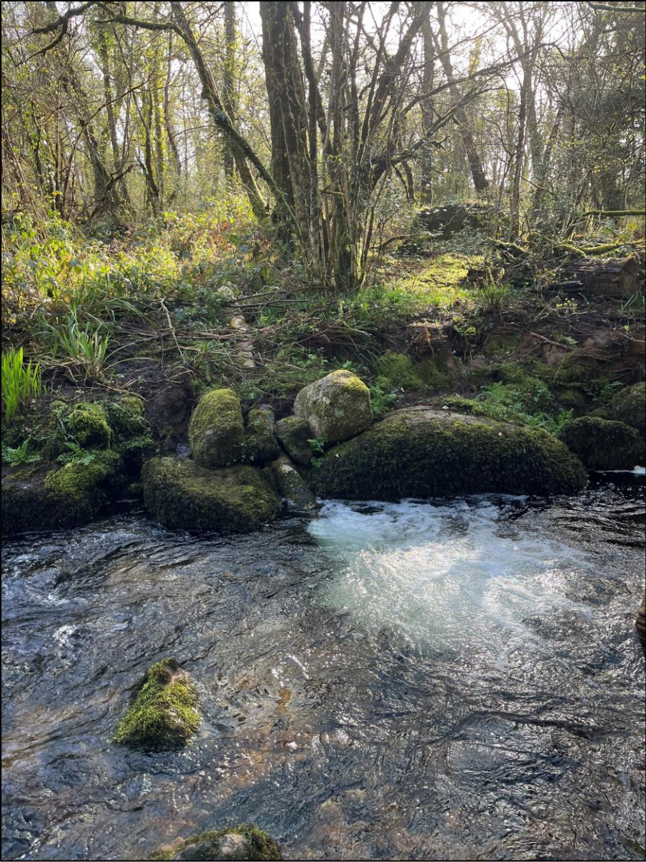
Photograph 8: Bywash pipe discharge point (April 2026)