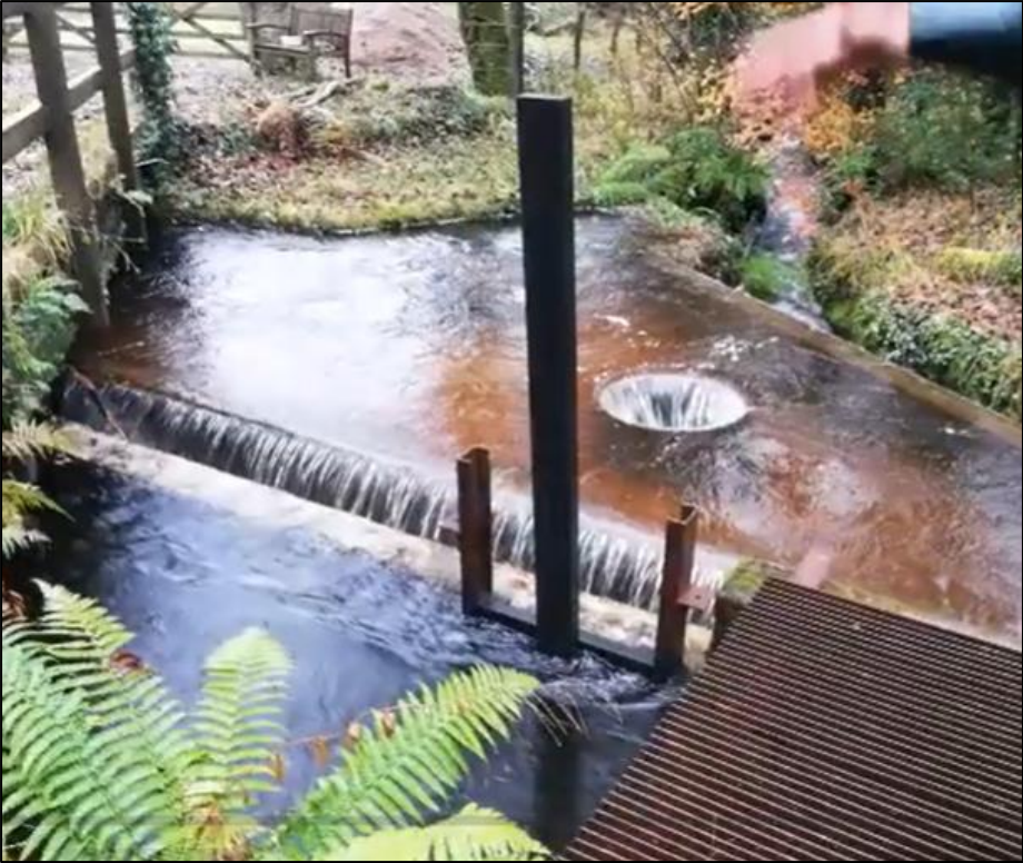
Photograph 5: Overflow Control