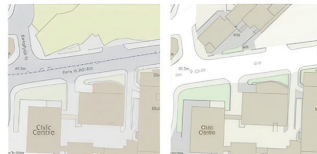
Original map style

We are updating the look of our map. The buttons have stayed the same.