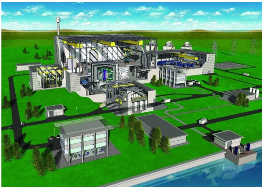
Figure 2 Possible layout of a fusion infrastructure site for one type of fusion technology (magnetic confinement)

Figure 2 is provided courtesy of UKAEA and EUROfusion.