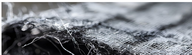
Woven fibres used to reinforce a material