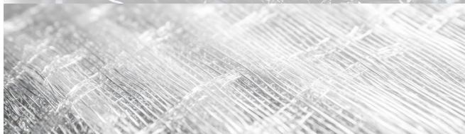
A fibreglass lattice