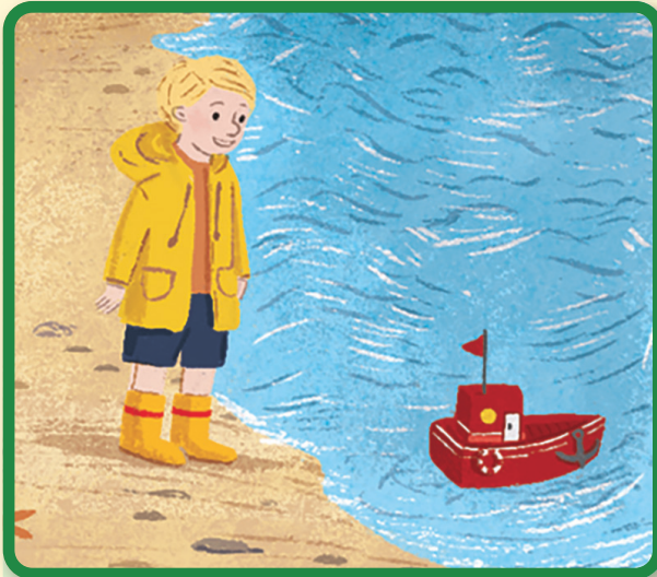
Jack's New Boat