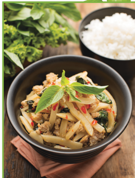
a bamboo stir-fry

We all need to keep our bodies healthy. Bamboo is packed with vitamins that are good for our skin, hair and bones. It's important to cook it carefully because raw bamboo shoots have a poison inside which is dangerous to humans when eaten!