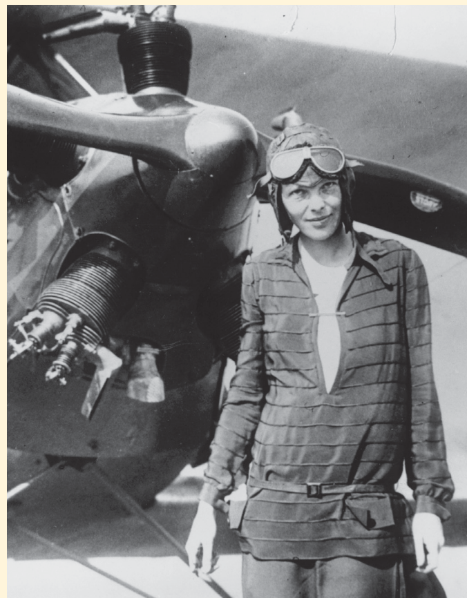
Amelia Earhart in front of the ' Friendship ' in 1928