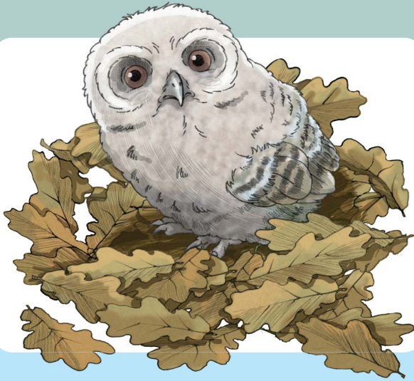
Owl in Danger