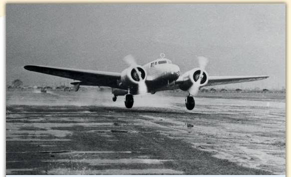
A 1930s aeroplane