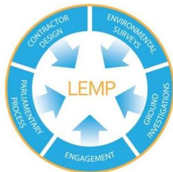
Figure 1: Key workstreams that will provide additional information for the LEMP.