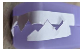
Broken new closure label along new cut pattern