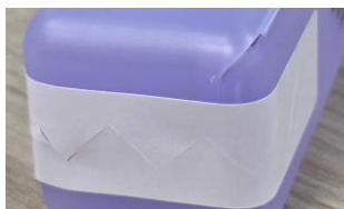
Integral new closure label with improved cut pattern