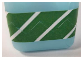
Integral new closure label with improved cut pattern