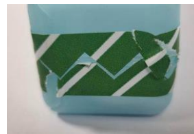
Broken new closure label along new cut pattern