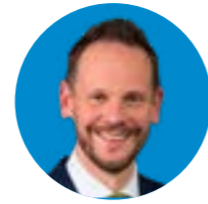
Simon Lightwood MP Parliamentary under Secretary