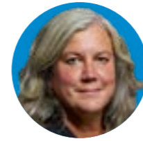
Rt Hon Heidi Alexander MP Secretary of State