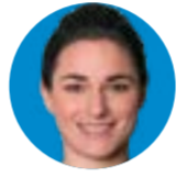
Dame Sarah Storey Non-Executive