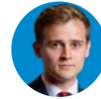
Keir Mather MP Parliamentary under Secretary