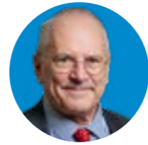
Lord Henry of Richmond Hill CBE Minister of State