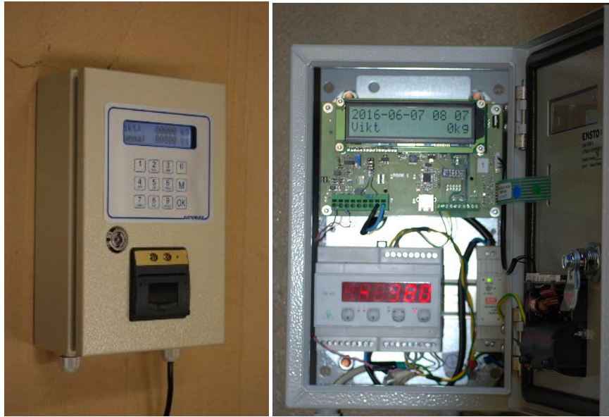
Figure 1 MHS electronics box