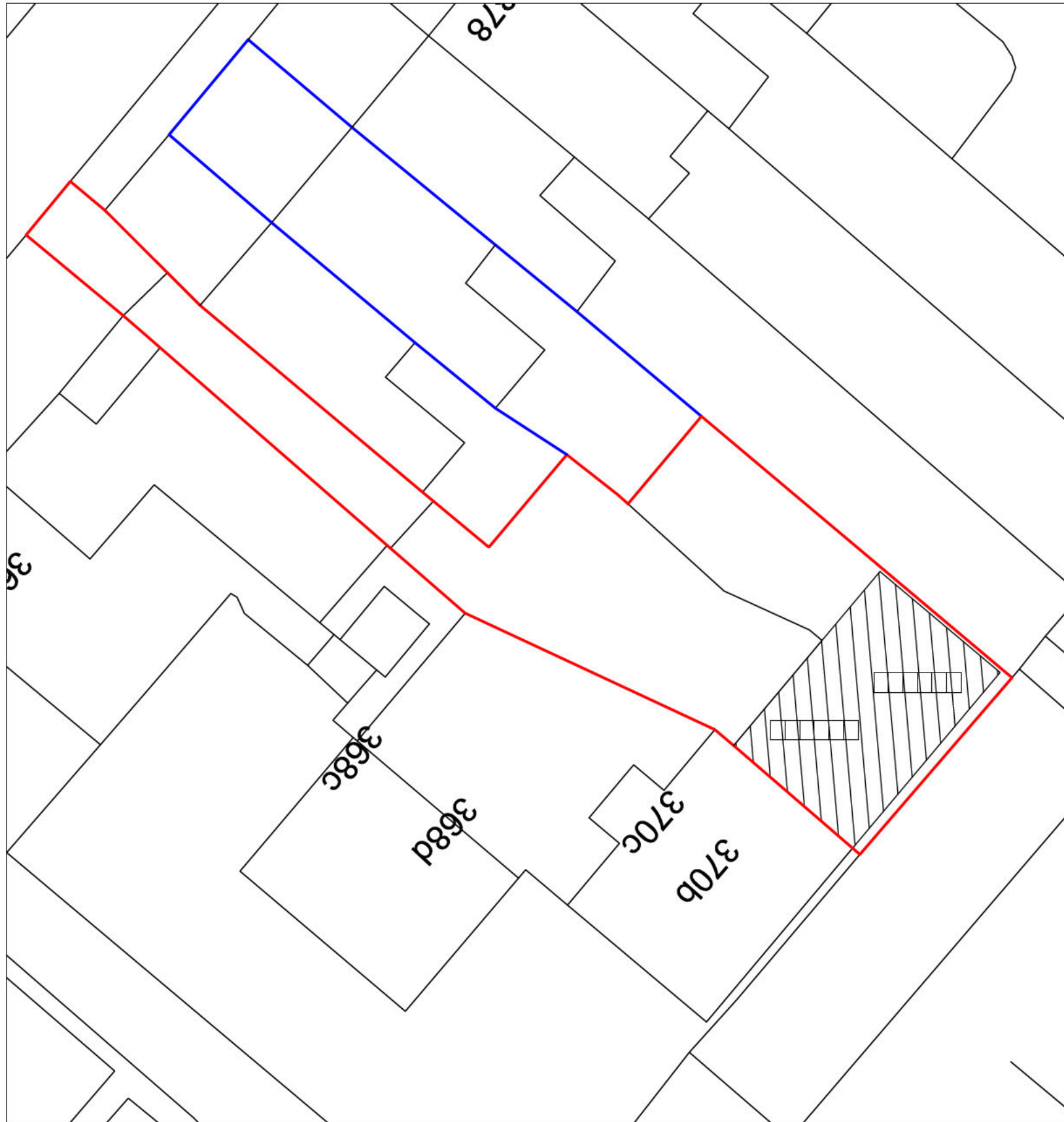
BLOCK PLAN 1:200