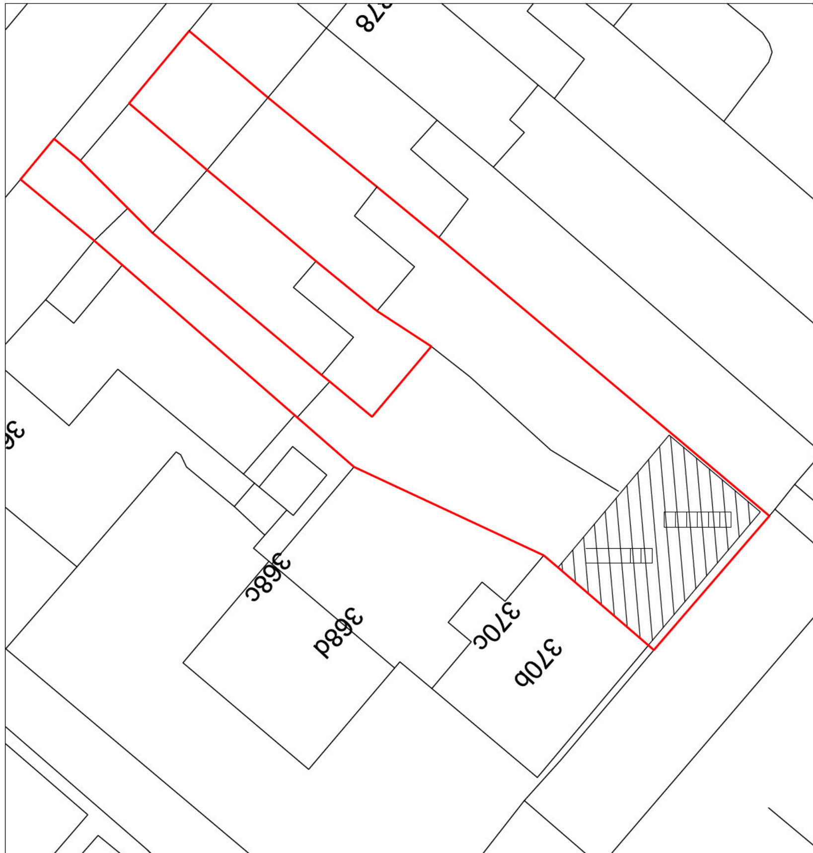
BLOCK PLAN 1:200