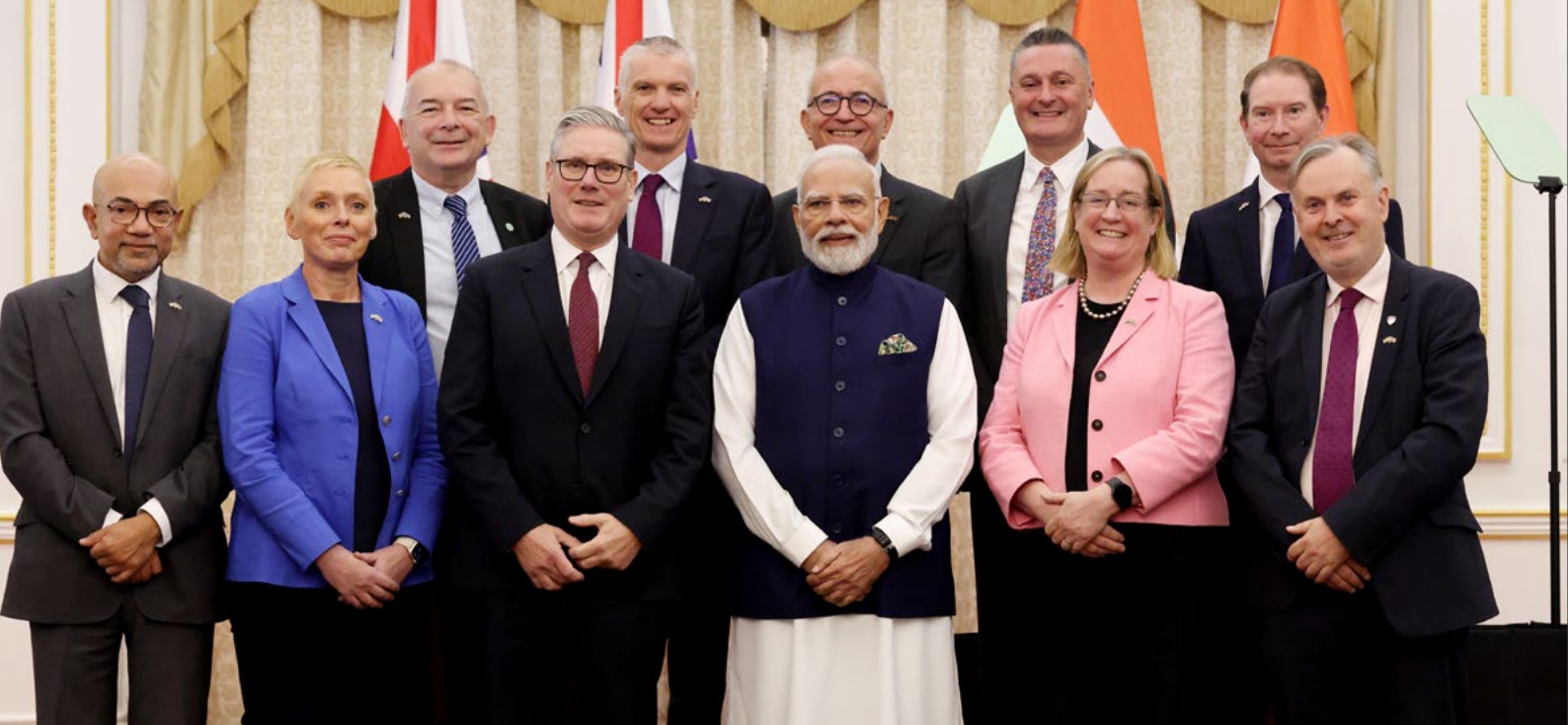
Image: The Prime Minister of the United Kingdom with the Prime Minister of India, Narendra Modi, and leaders from UK universities