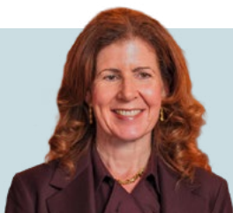
The Rt Hon Baroness Chapman of Darlington Minister of State for International Development and Africa

The world is changing fast. Geopolitical tensions, rapid technological innovation, and urgent challenges such as climate change are reshaping the way nations interact and the skills people need to thrive. In this uncertain world, education matters more than ever. This International Education Strategy sets out how we will use our country's strengths in education to expand growth and opportunity beyond our borders while serving the national interest.