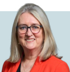
The Rt Hon Baroness Smith of Malvern Minister of State for Skills and Women and Equalities