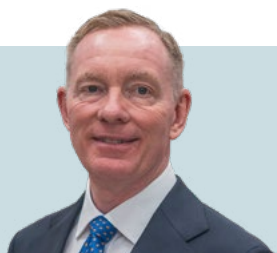
Sir Chris Bryant MP Minister of State for Trade