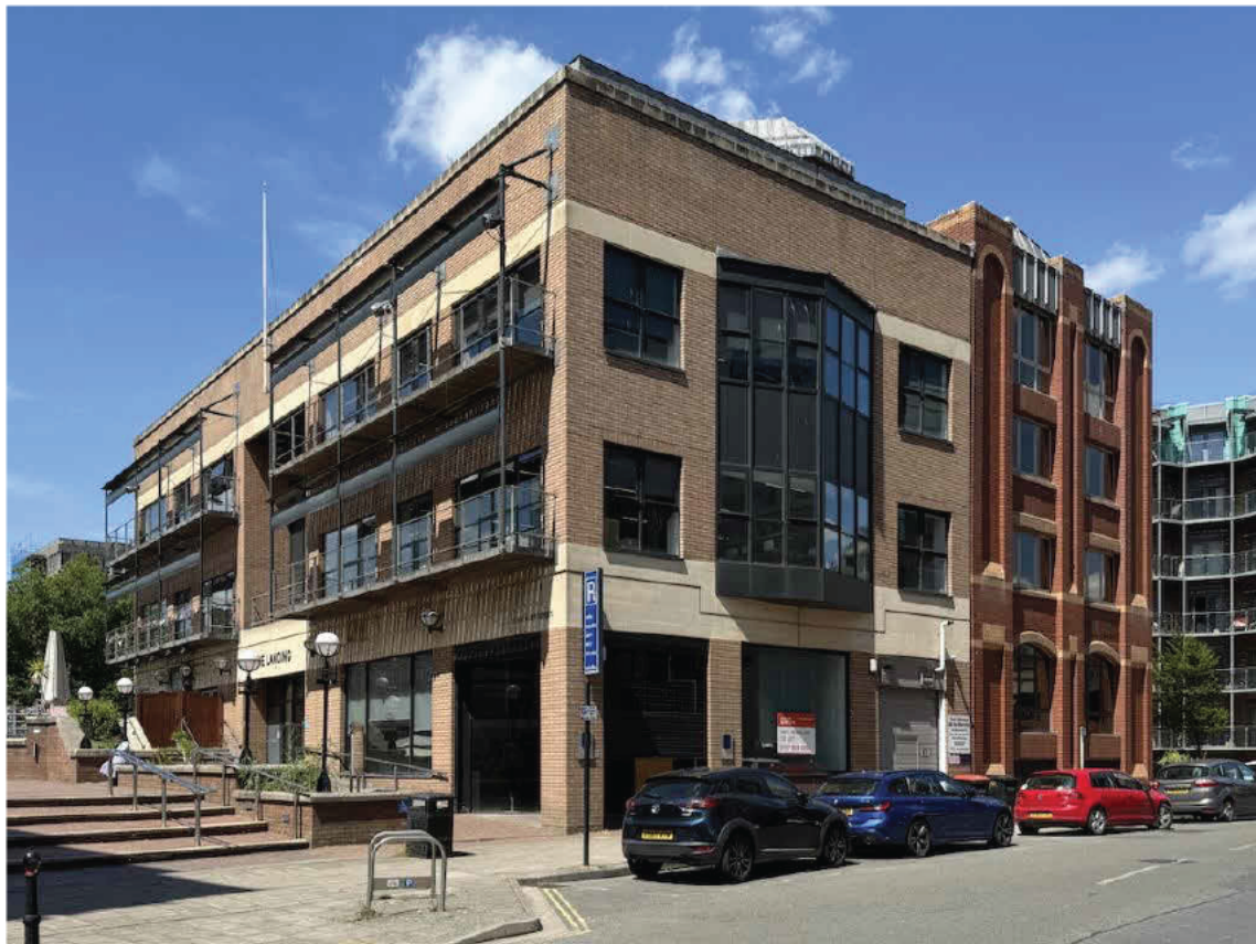
View 02 N.T.S