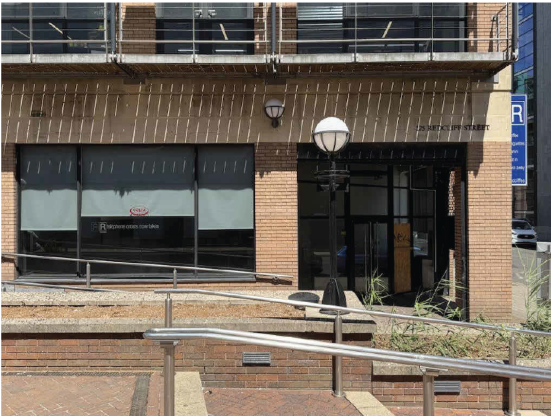
View 03 N.T.S

Do not scale from this document, unless for the purposes of planning applications where a scale bar is provided. Refer to figured dimensions only. All dimensions to be verified on site prior to construction. Report all discrepancies or ambiguities to the Document Originator immediately. This document is to be read in conjunction with relevant documents, drawings and standards.