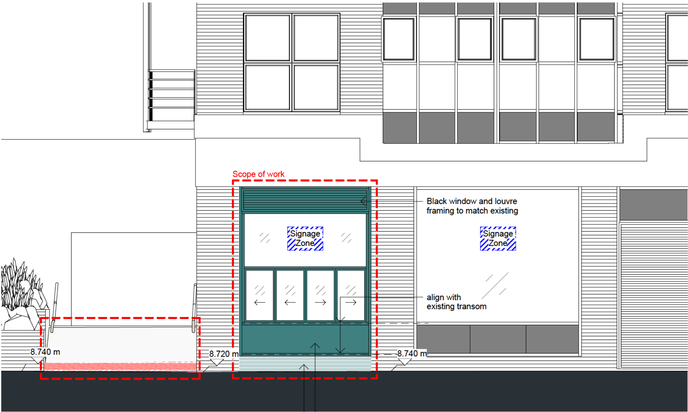
Proposed East Elevation - The Landing 1 : 50