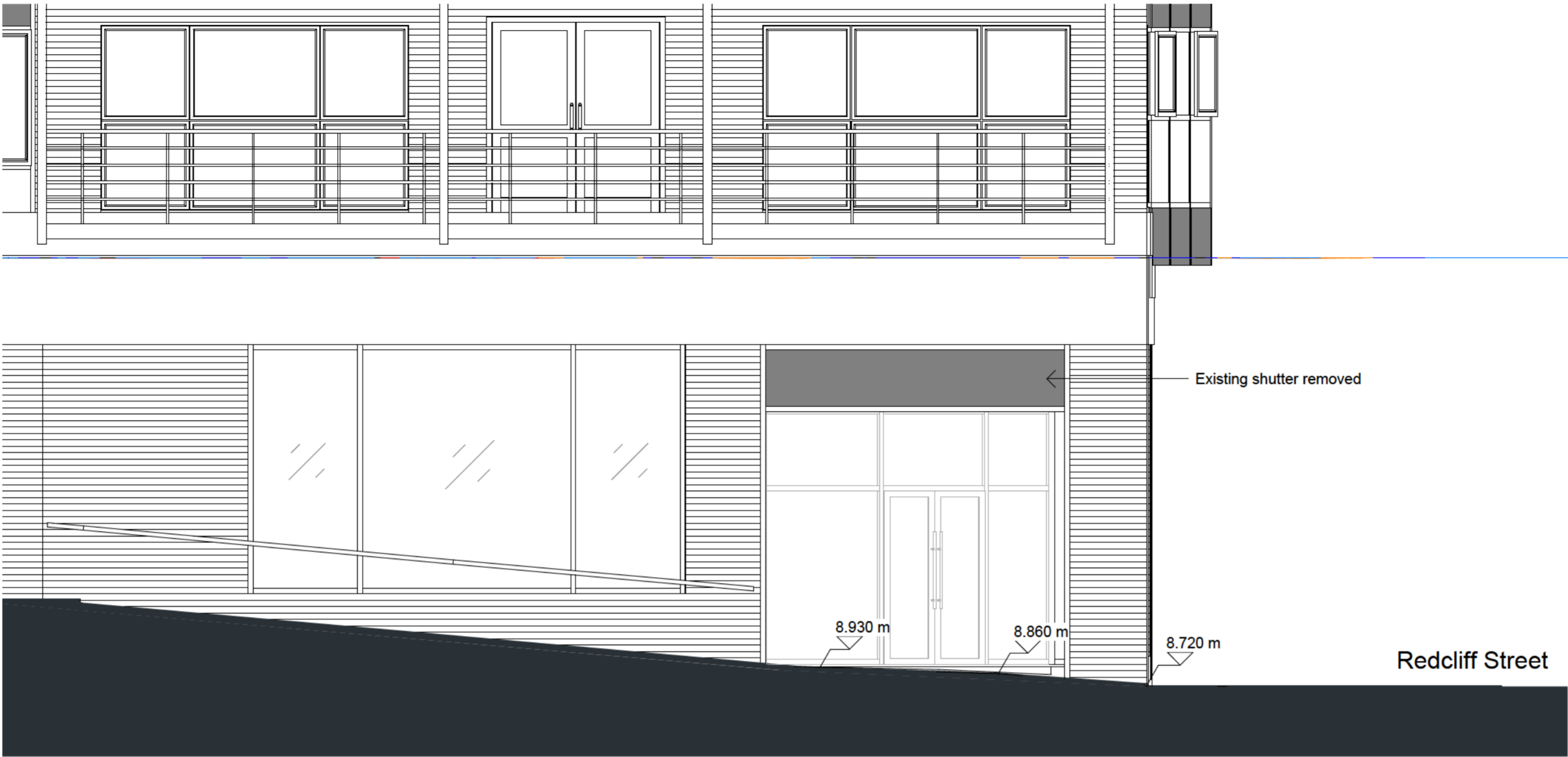
Existing South Elevation - The Landing 1 : 50