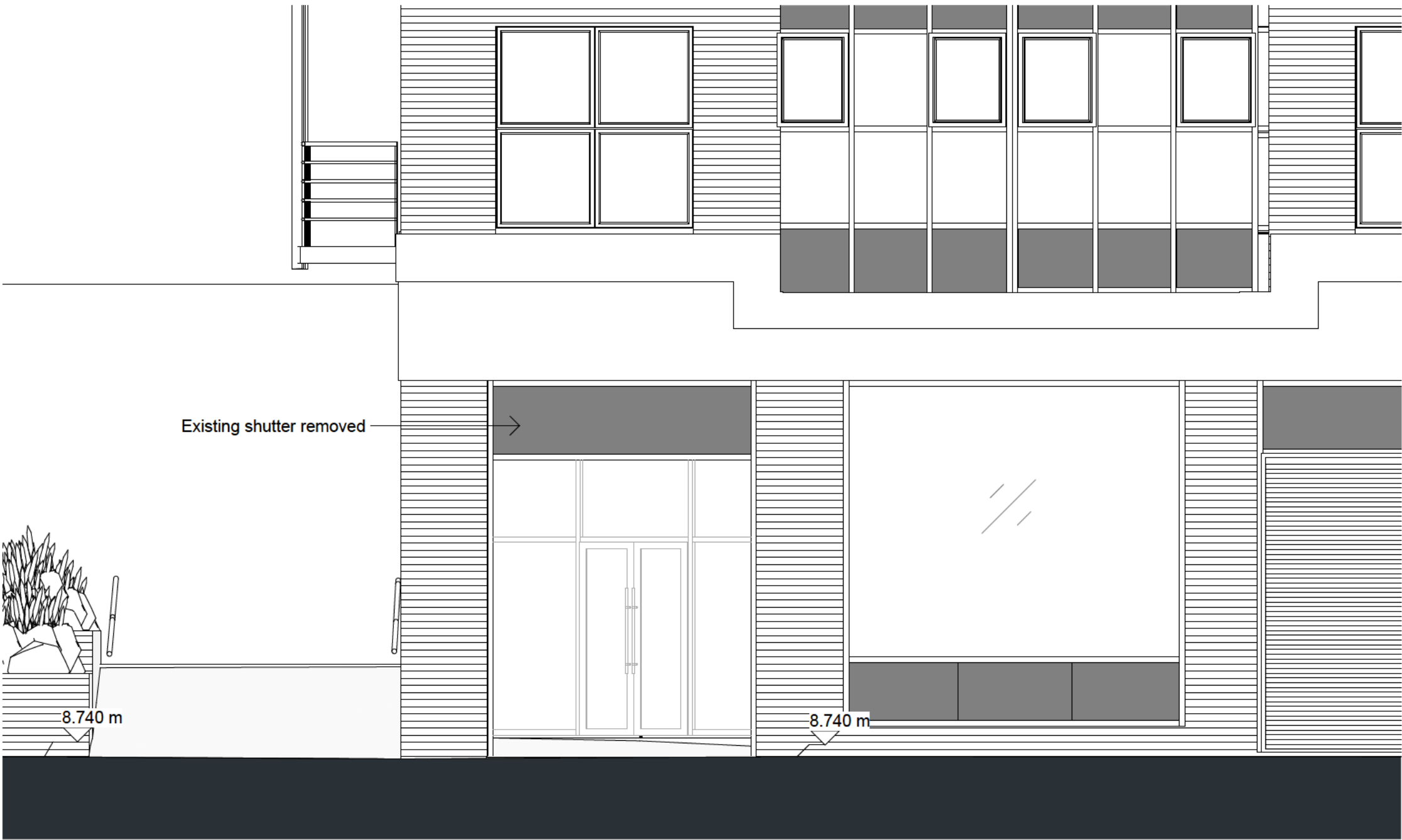
Existing East Elevation - The Landing 1 : 50