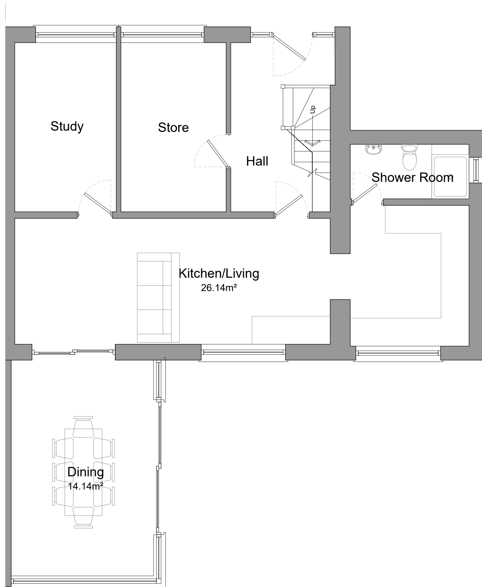
Ground Floor GIA = 71.97m 2