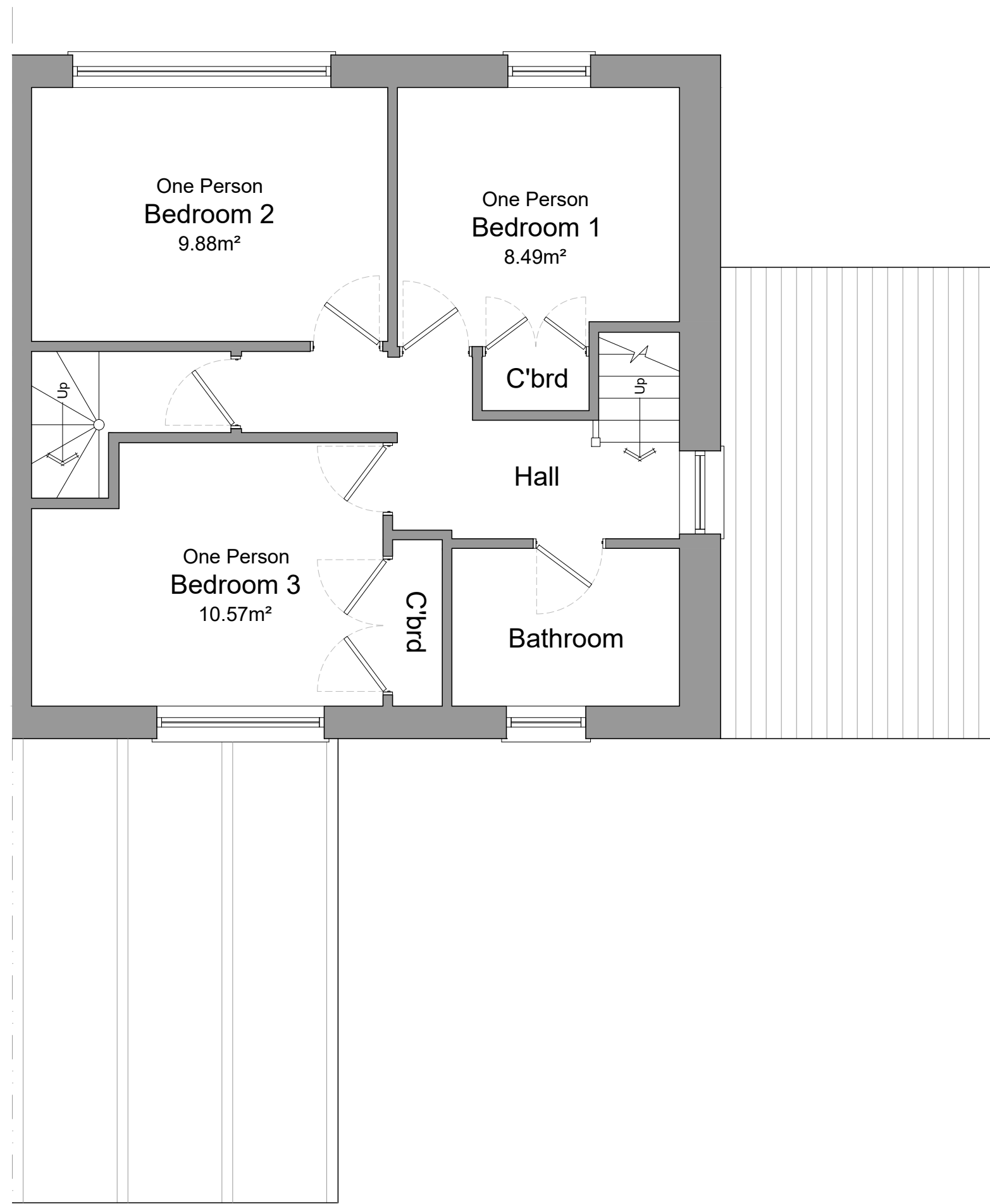
First Floor GIA = 43.83m 2