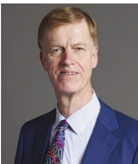
Sir Stephen Timms Co-chair of the Timms Review.