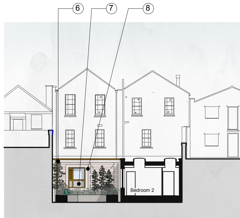
Proposed Section / Elevation DD