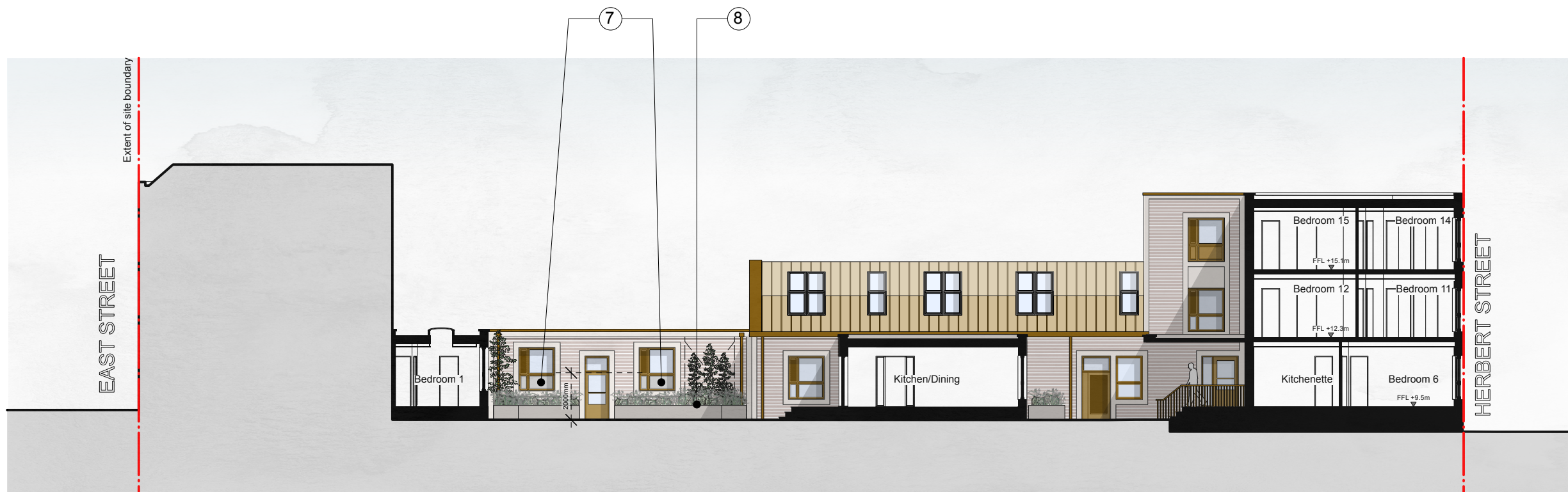
Proposed North East Elevation & Section BB