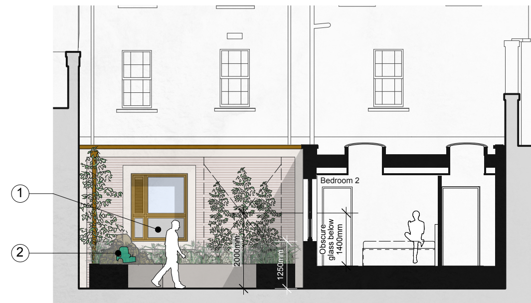
Proposed Section / Elevation DD Through Garden