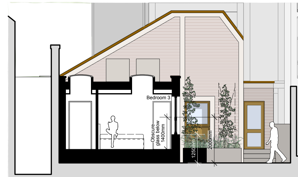
Proposed Section / Elevation CC Through Garden