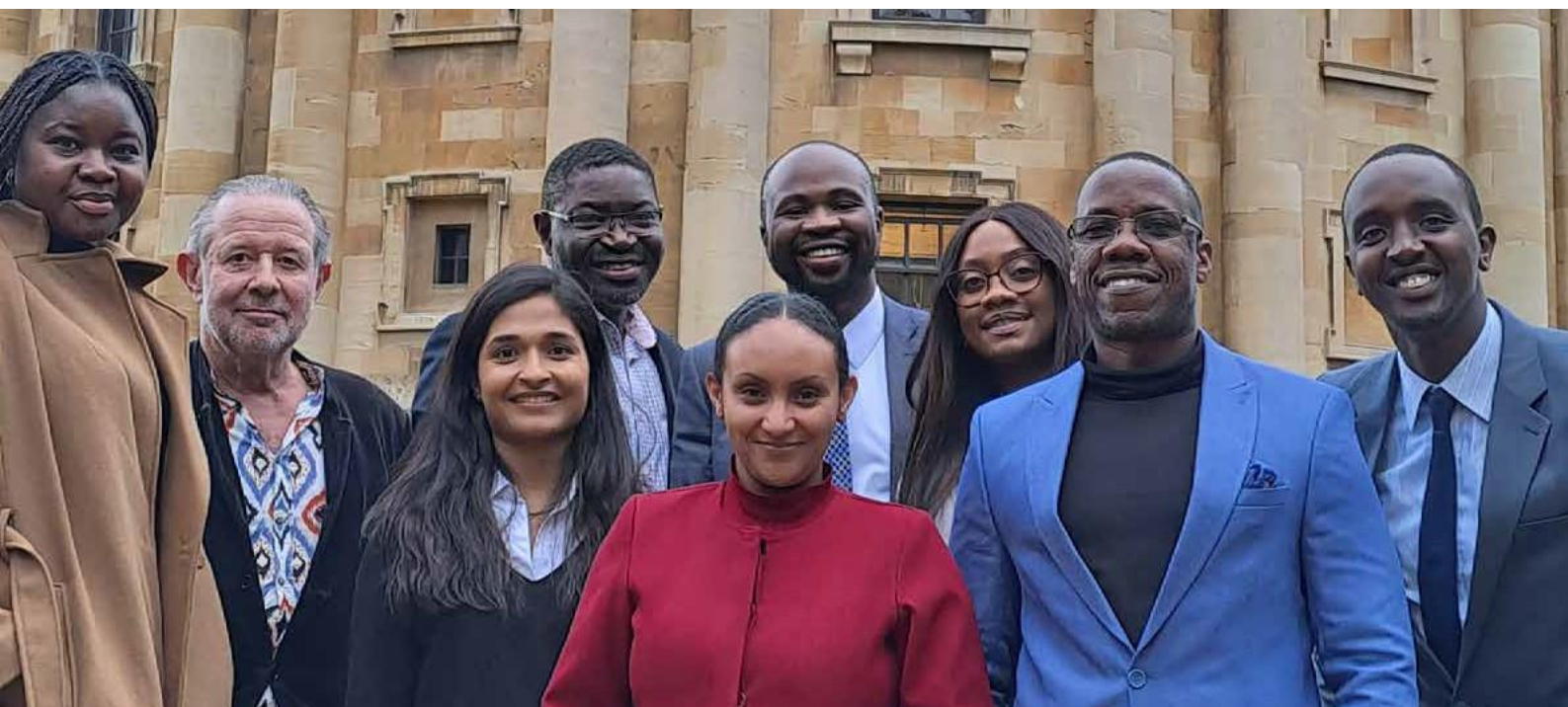
Teaching visiting lawyers on the International Lawyers for Africa programme