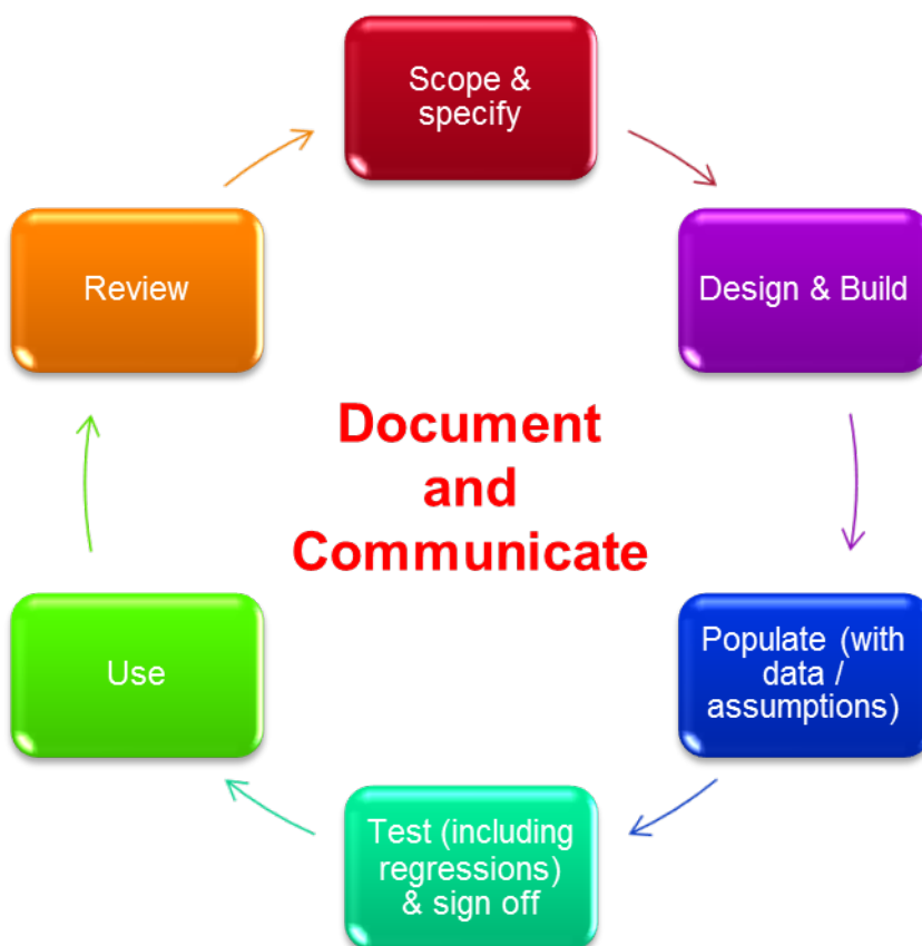
Figure 2: A visual representation of the model creation cycle

Figure 2 shows a visualisation of a modelling cycle, and the individual sections are detailed further below.