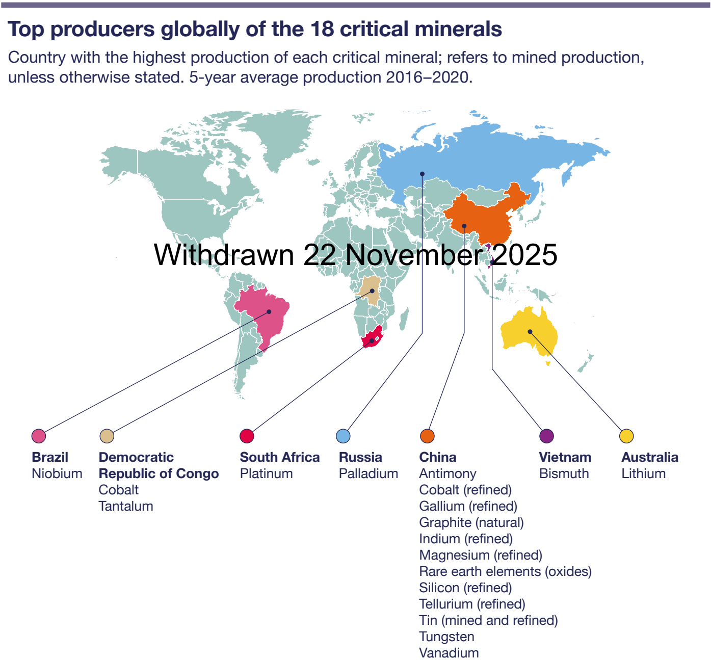
Figure 3: Top global producers (5-year average 2016-2020) by mineral. Mined production unless otherwise stated. 20

Critical mineral supply chains are highly concentrated. For each of the 18 critical minerals, the top three producer countries control between 73 and 98 percent of total global production. China is the biggest producer of 12 out of the 18 minerals. 19 Australia, Brazil, the Democratic Republic of Congo, Russia, South Africa and Vietnam are the biggest producers of the remaining six (Figure 3). We believe that the more diverse our supply chains the more resilient they are.