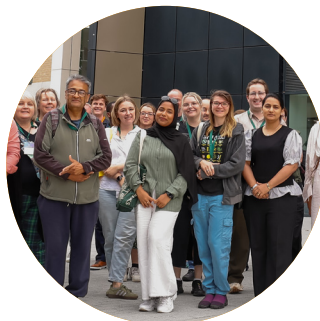
EDI in Commercial Work Instructions