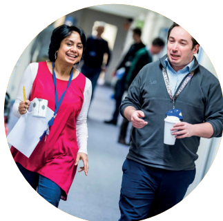
Annual EDI Reports