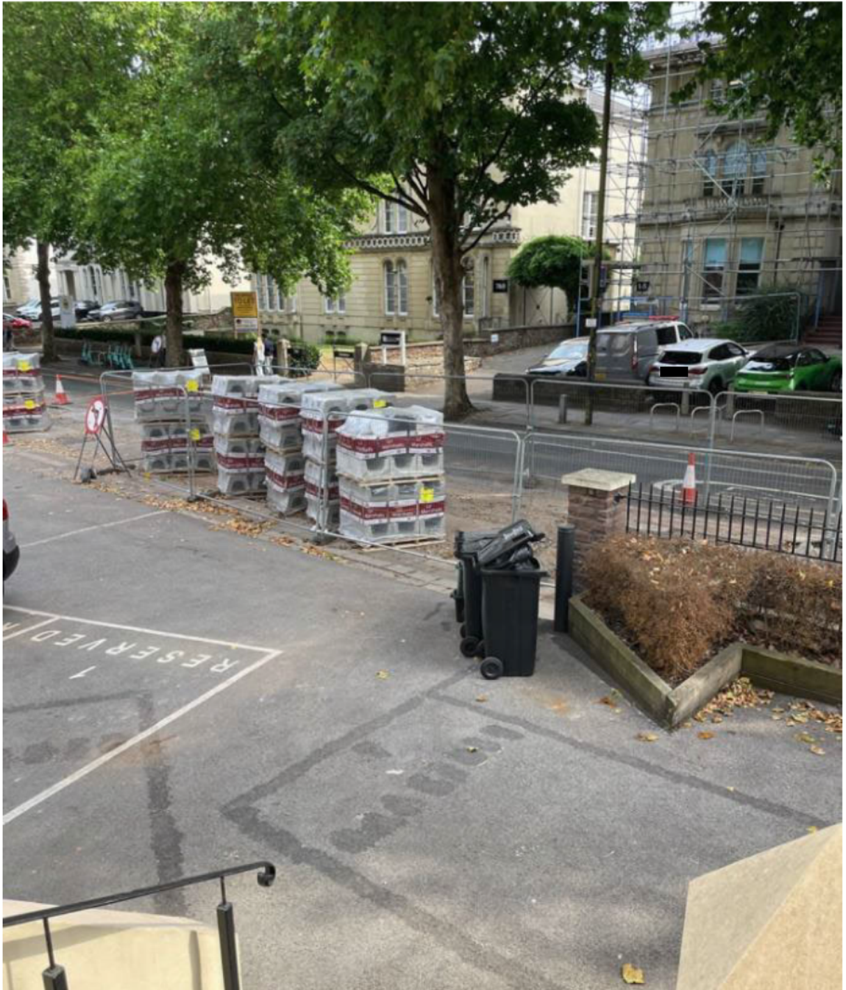
APPENDIX - Photographs of ongoing flood mitigation and road improvement works at Whiteladies Road, taken 19 th August 2025.