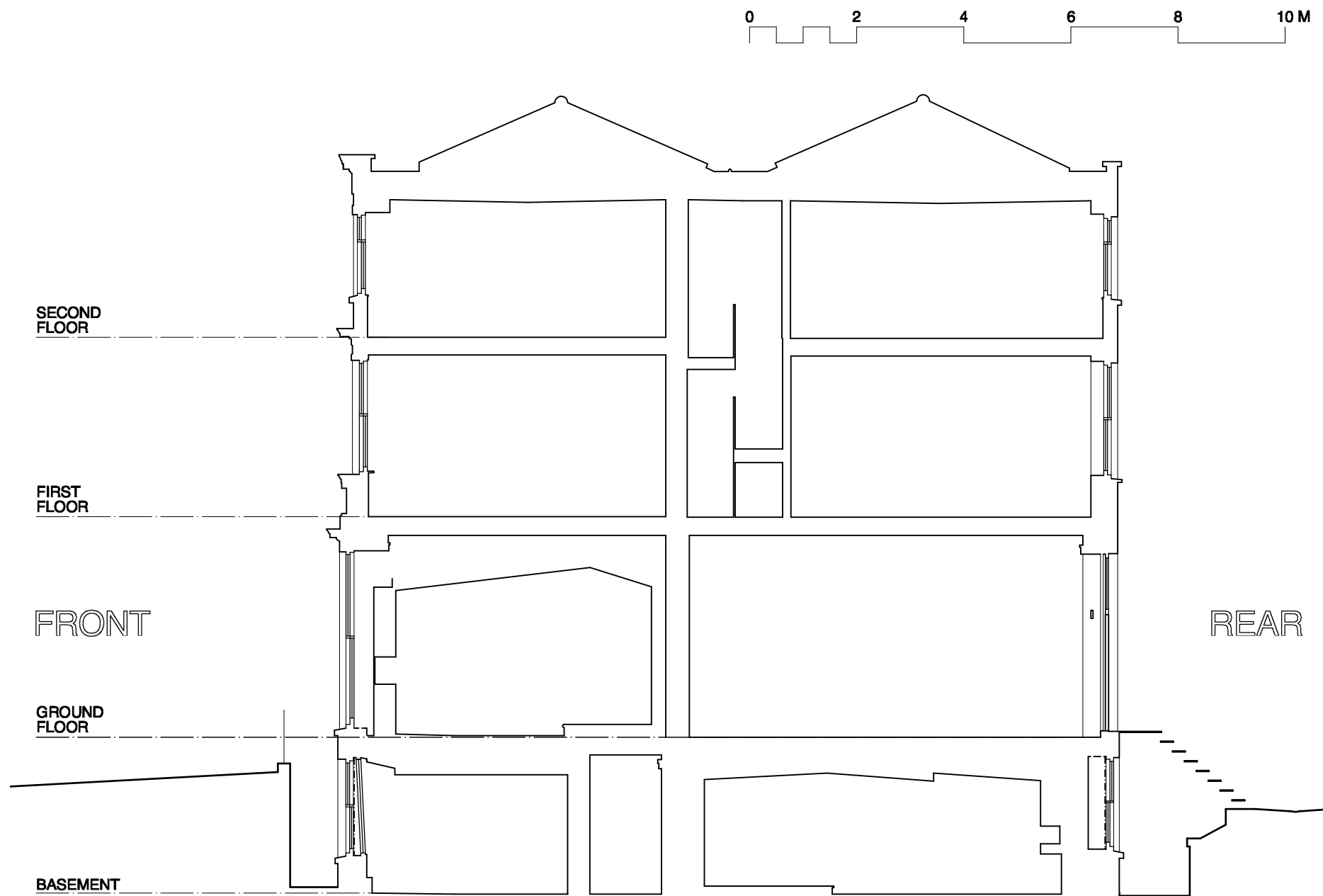
Existing Section A-A