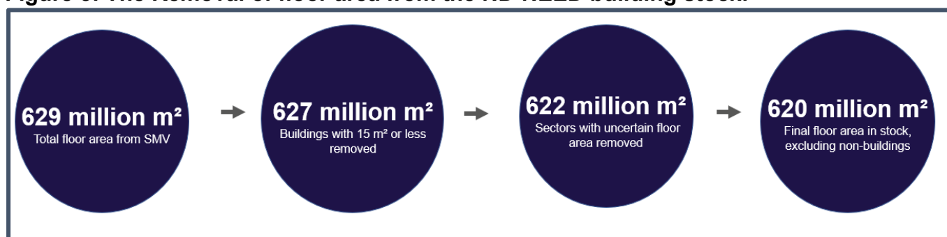
Figure 3: The Removal of floor area from the ND-NEED building stock.

All floor area data presented is therefore believed to be an underestimate. Table 13 shows that the proportion of buildings missing floor area information in ND-NEED varies substantially between sectors. Due to variations, floor area comparisons between sectors must be done with caution.