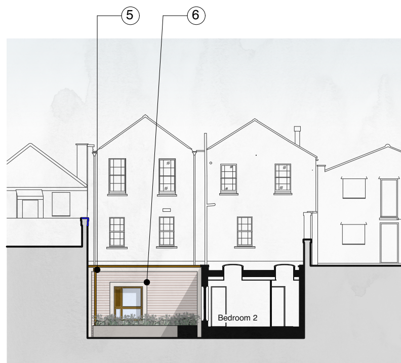
Proposed Section / Elevation DD