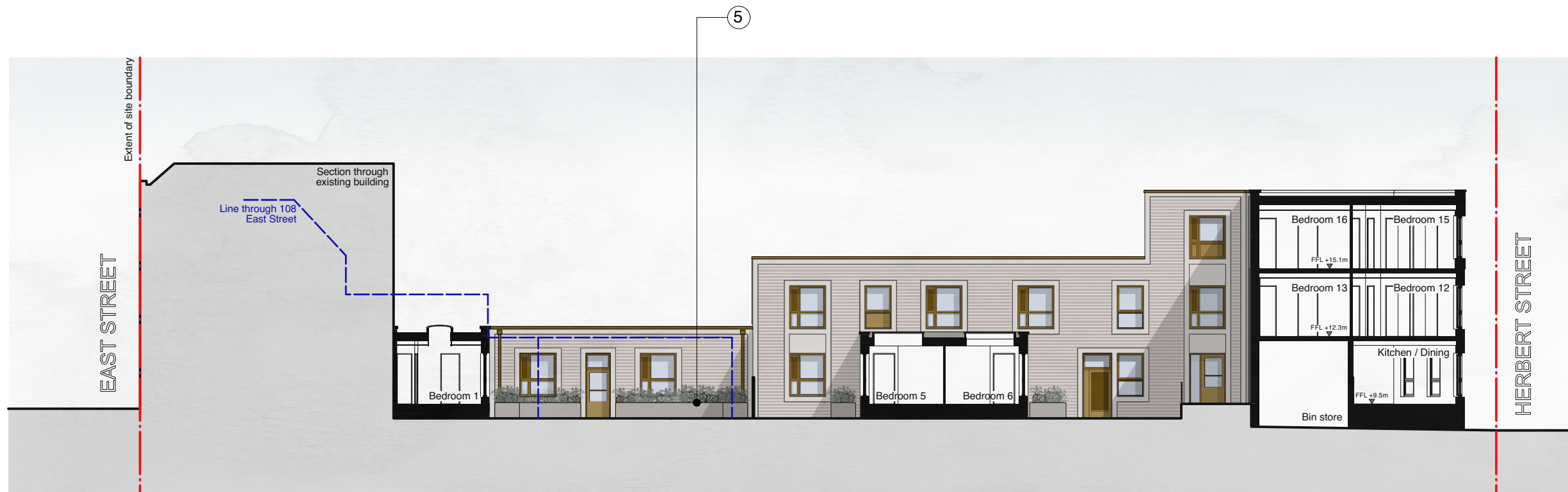
Proposed North East Elevation & Section BB