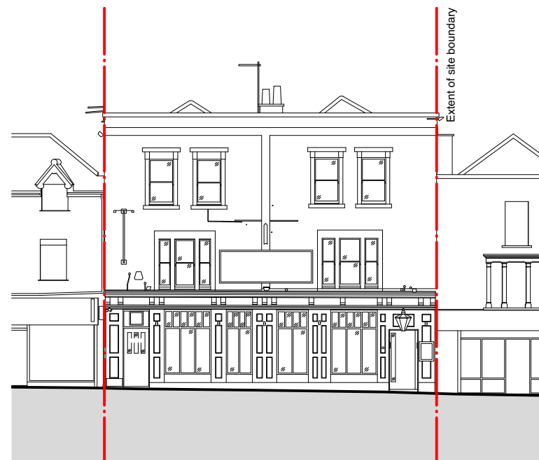
Existing South East Elevation