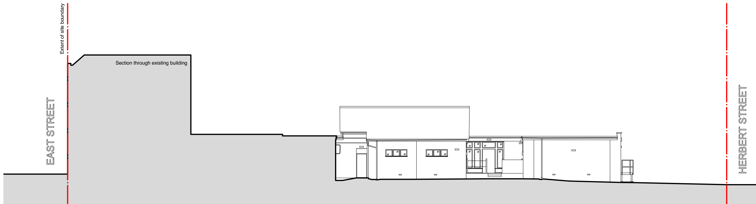
Existing North East Elevation