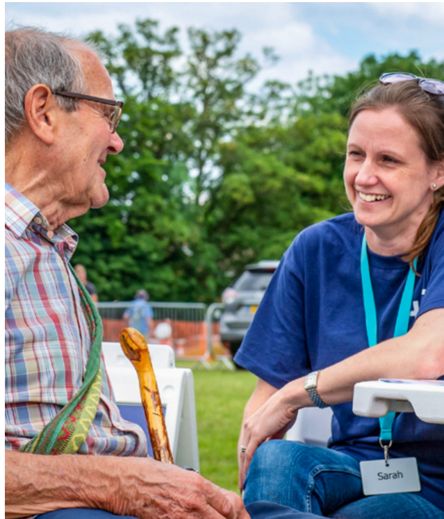
HS2 staff member engaging with members of the public at the HS2 Roadshow event in Hertfordshire.