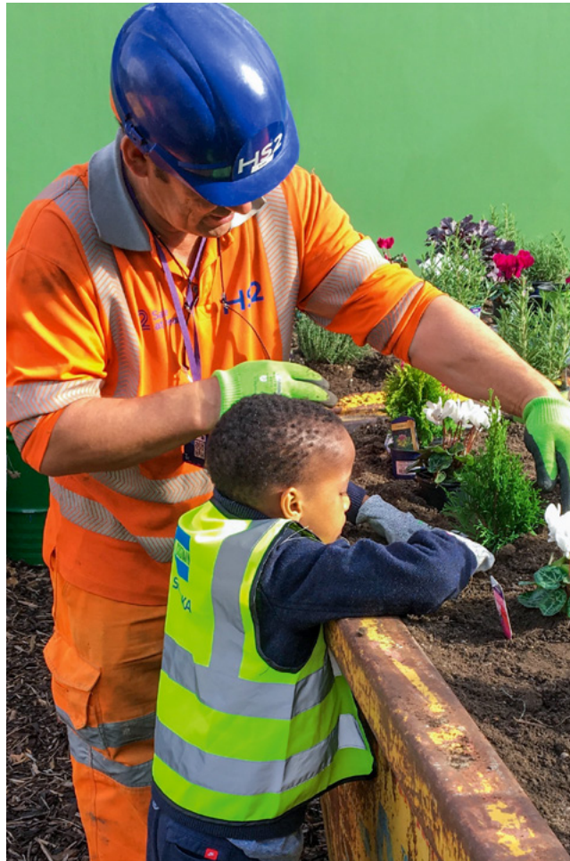
HS2 staff member planting flowers with members of the public at a local community garden in London.