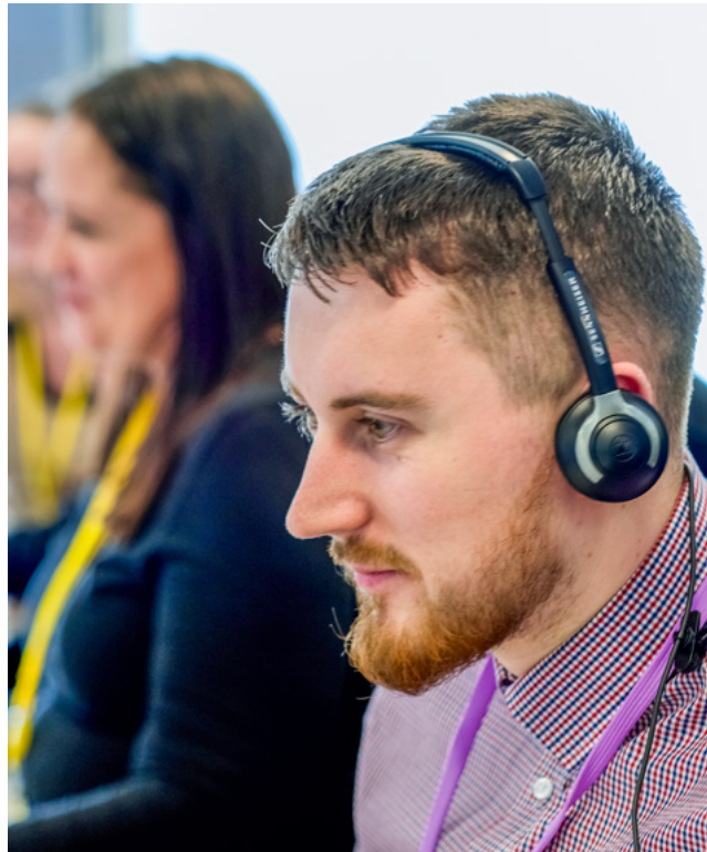
Members of HS2 Helpdesk team.