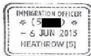
Immigration Officer's Date Stamp

In a small number of cases, when the Schemes went live, a Code 1A was not available, in place of this a Code 1 was used with the "no recourse to public funds" scored out in ink and possibly initialled by the Officer.