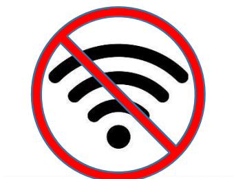
Wi-Fi stereos/radios are not permitted

There is also a need to check that the stereos/radios purchased operate on Bluetooth only and not on Wi-Fi – this is easily done by looking at the box and checking that there is no reference to Wi-Fi. You can also check that there is only the Bluetooth symbol and not the Wi-Fi symbol as below.