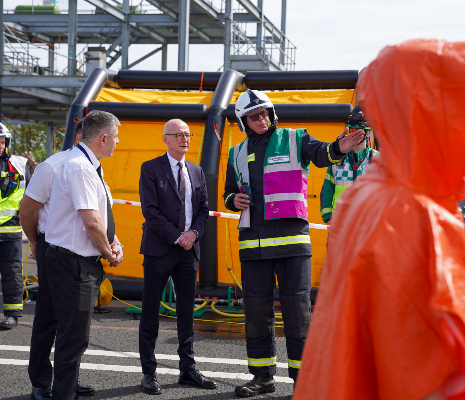
Picture: Chancellor of the Duchy of Lancaster visiting Cleveland Fire Brigade HQ, Cabinet Office.