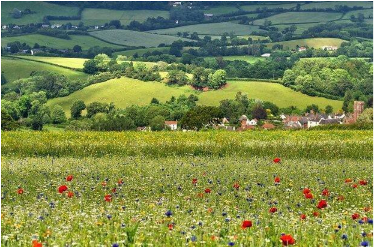
Provide habitat and food sources for farmland wildlife