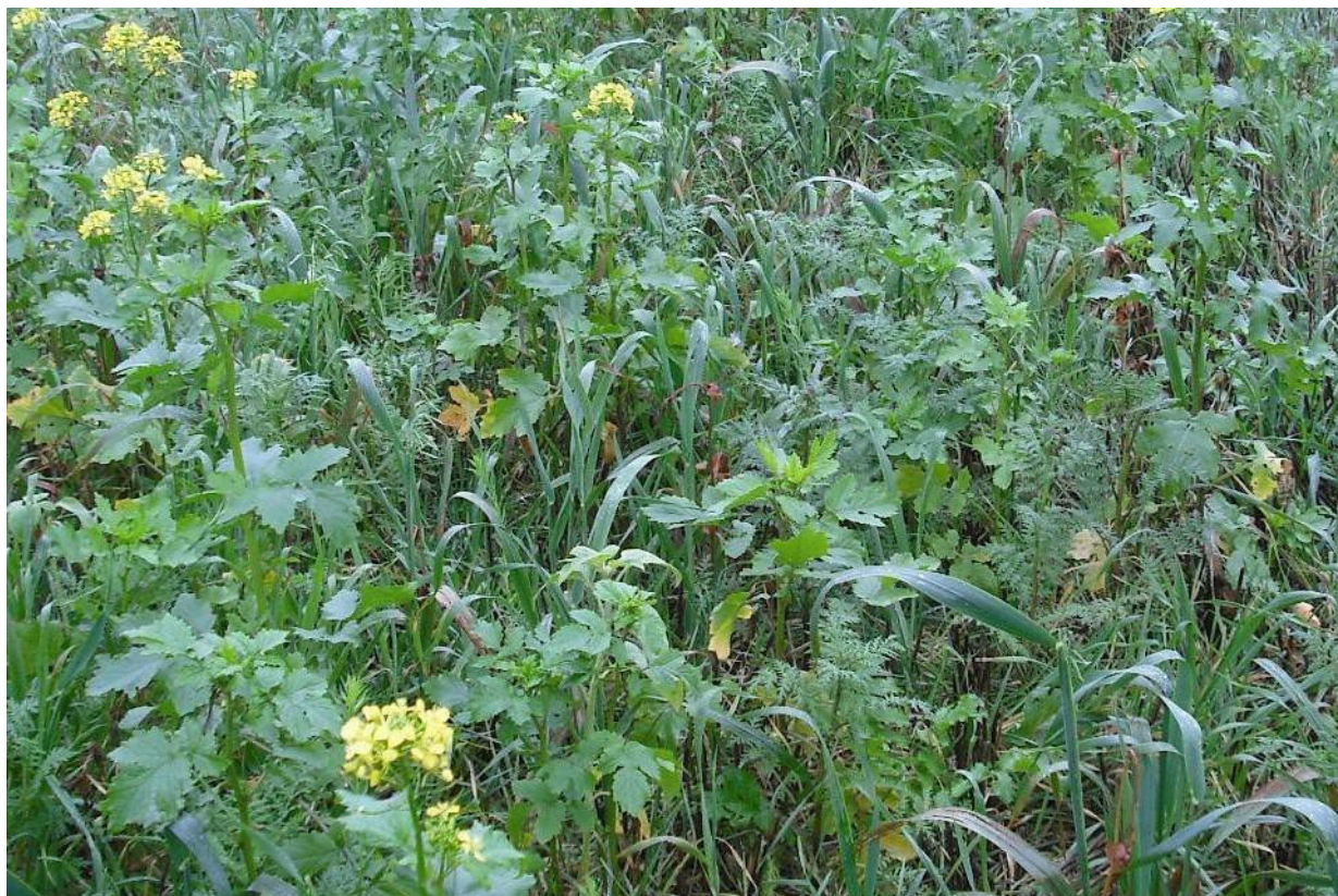
Multi-species winter cover to improve soil health

These actions can help with the long-term productivity and resilience of the soil to benefit food production. They can also provide environmental benefits, such as better water quality, improved climate resilience and increased biodiversity.