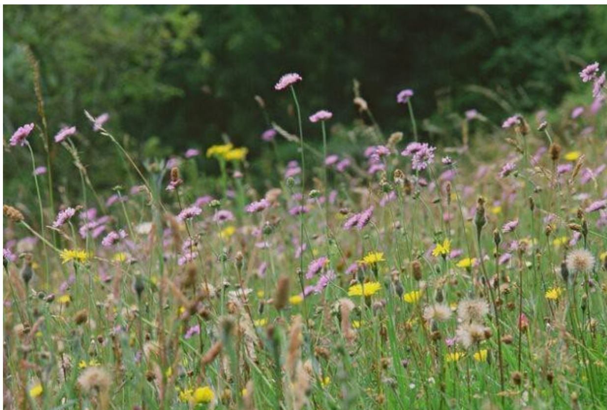
Create habitats to support an IPM approach