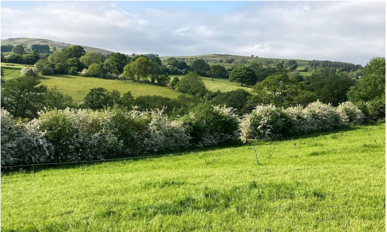
Provide habitat and food sources for farmland wildlife