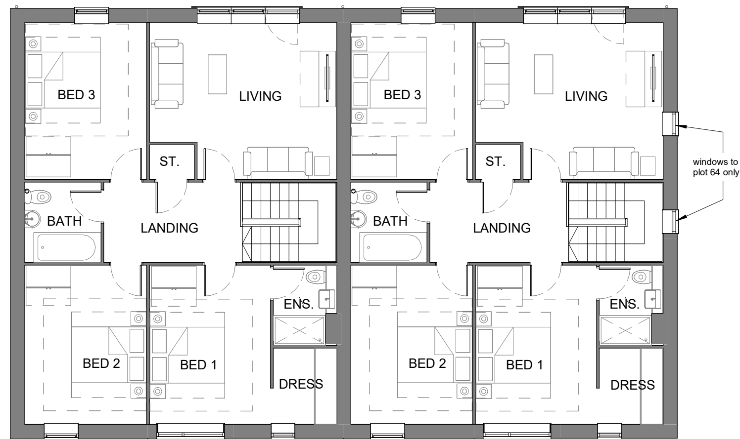
First Floor 1 : 100