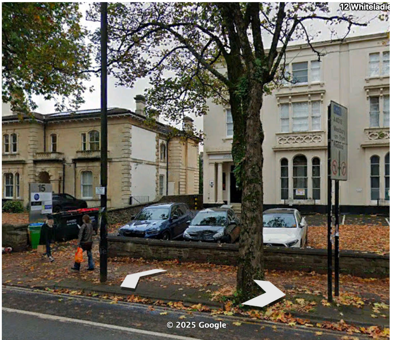
Figure 1: Existing waste collection day holding store to the front left of no. 11

The refuse and recycling bins will be moved to the holding area adjacent to the pavement on the days for collection by a member of staff. This is where existing waste for the offices is currently collected from (fig 1). Once the waste has been collected the bins will be returned promptly to the refuse store.