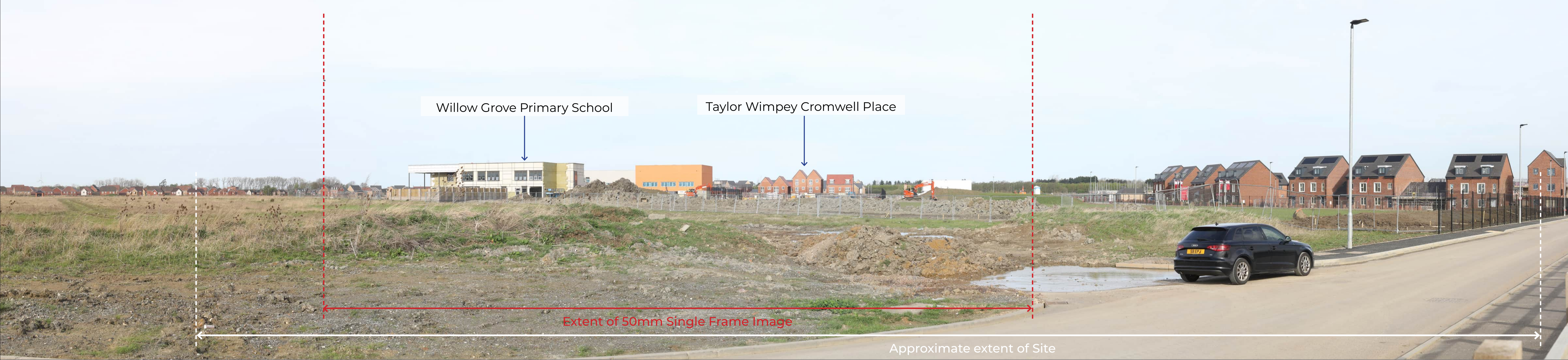
FIGURE 7.8 VIEWPOINT PHOTOGRAPHY