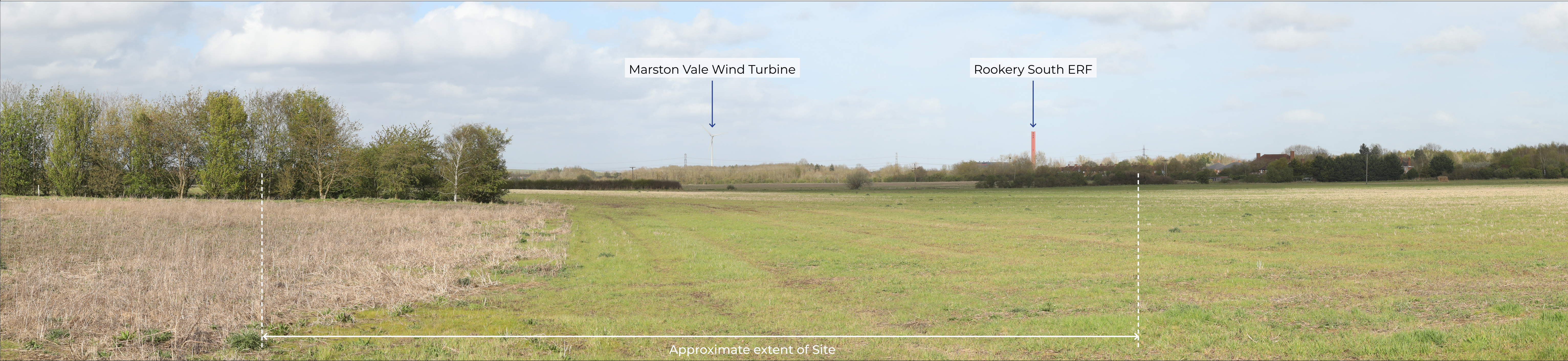
FIGURE 7.8 VIEWPOINT PHOTOGRAPHY