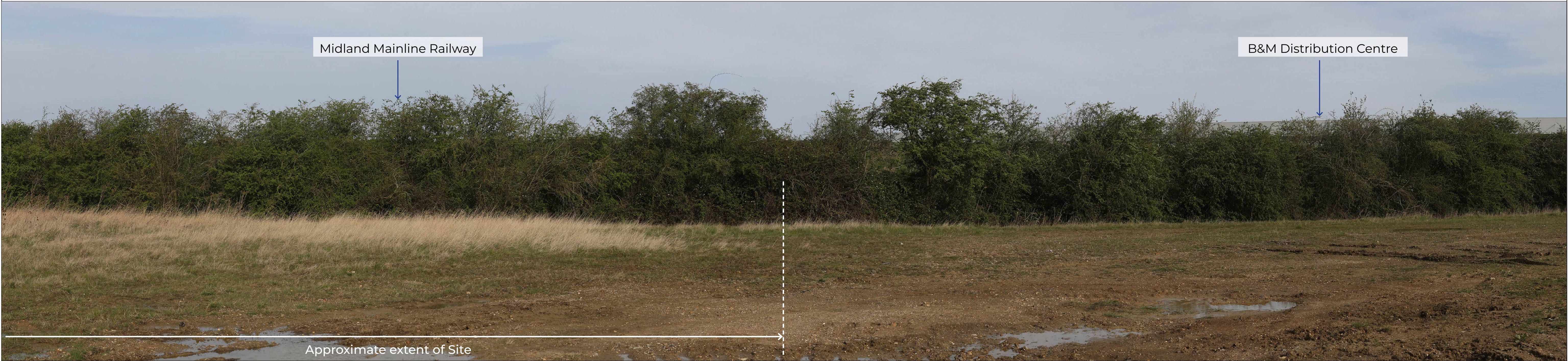
FIGURE 7.8 VIEWPOINT PHOTOGRAPHY FOR INFORMATION