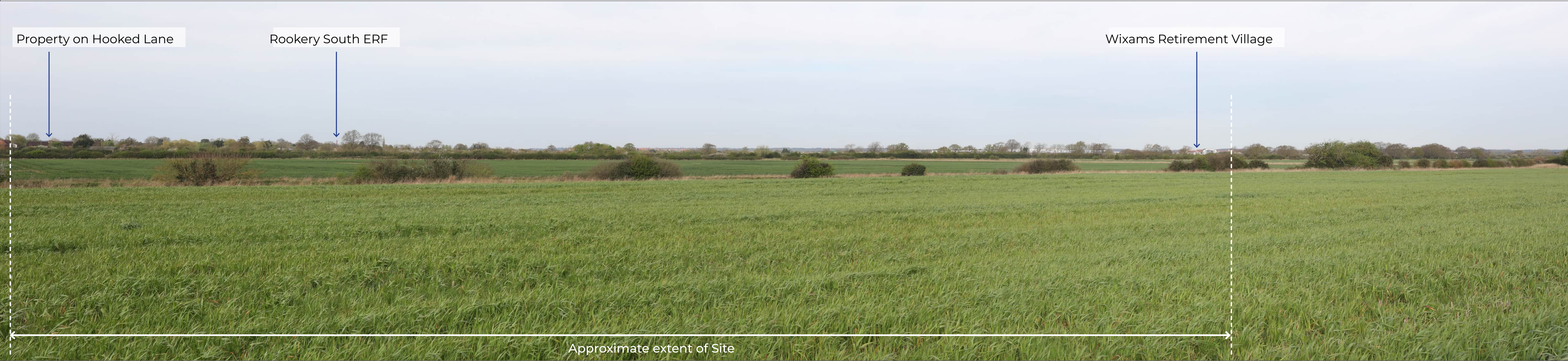
FIGURE 7.8 VIEWPOINT PHOTOGRAPHY