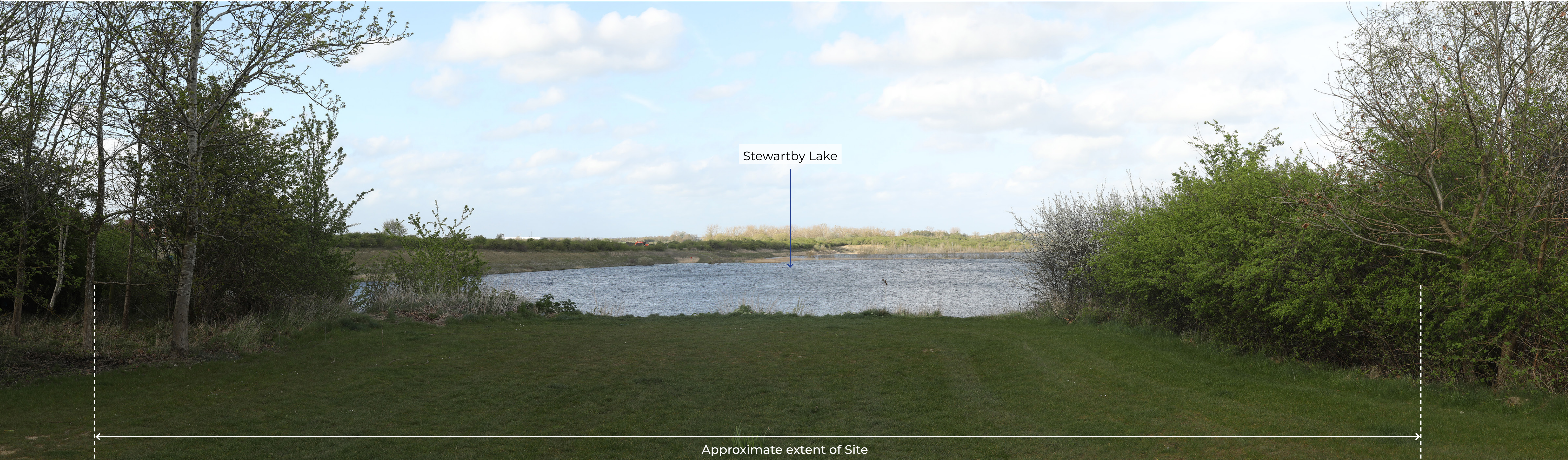
FIGURE 7.8 VIEWPOINT PHOTOGRAPHY