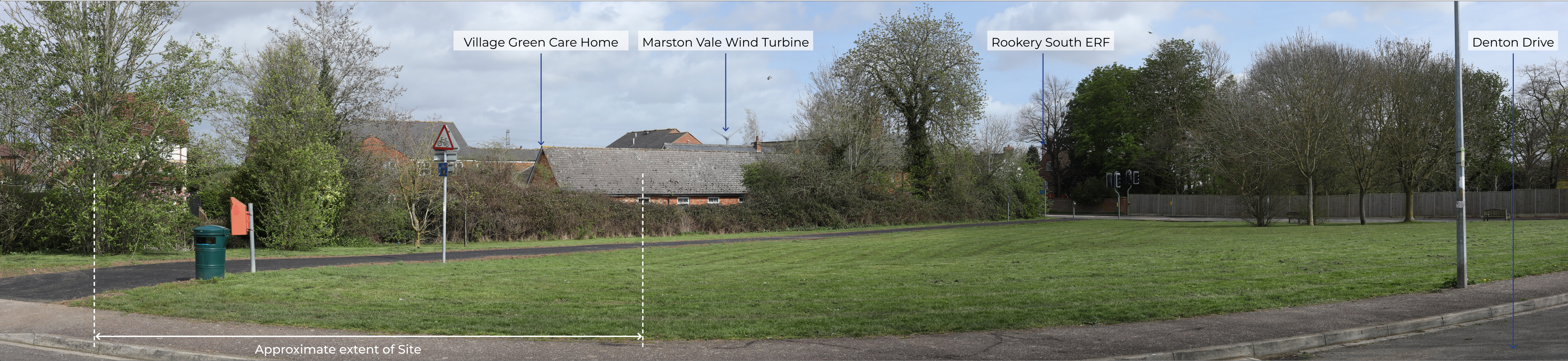
FIGURE 7.8 VIEWPOINT PHOTOGRAPHY