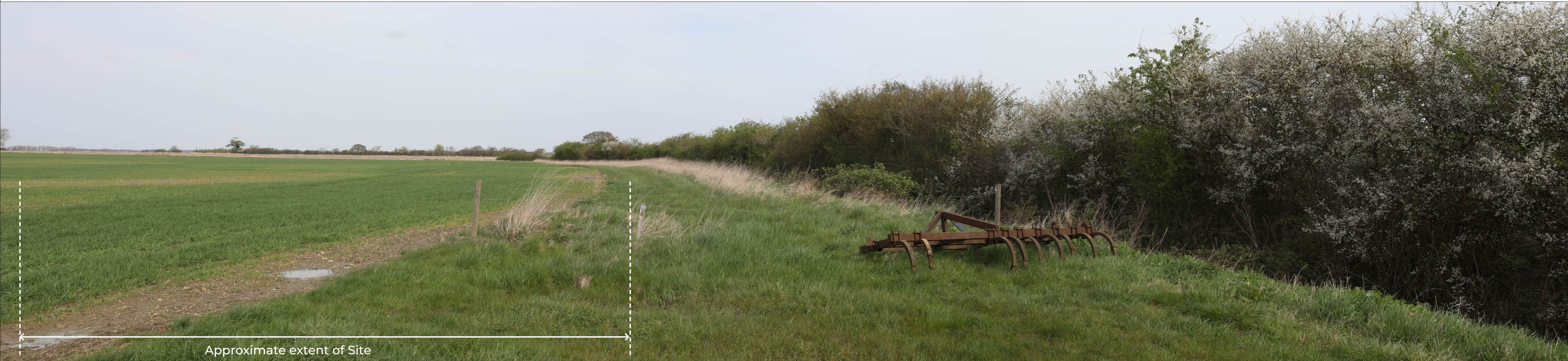
FIGURE 7.8 VIEWPOINT PHOTOGRAPHY

View direction: 360 degree view Viewpoint Elevation (AOD): 36.77 Photography Date: 07/04/2024 Photography Time: 14:38:15 Approximate distance to Proposed Development: Within Red Line Boundary