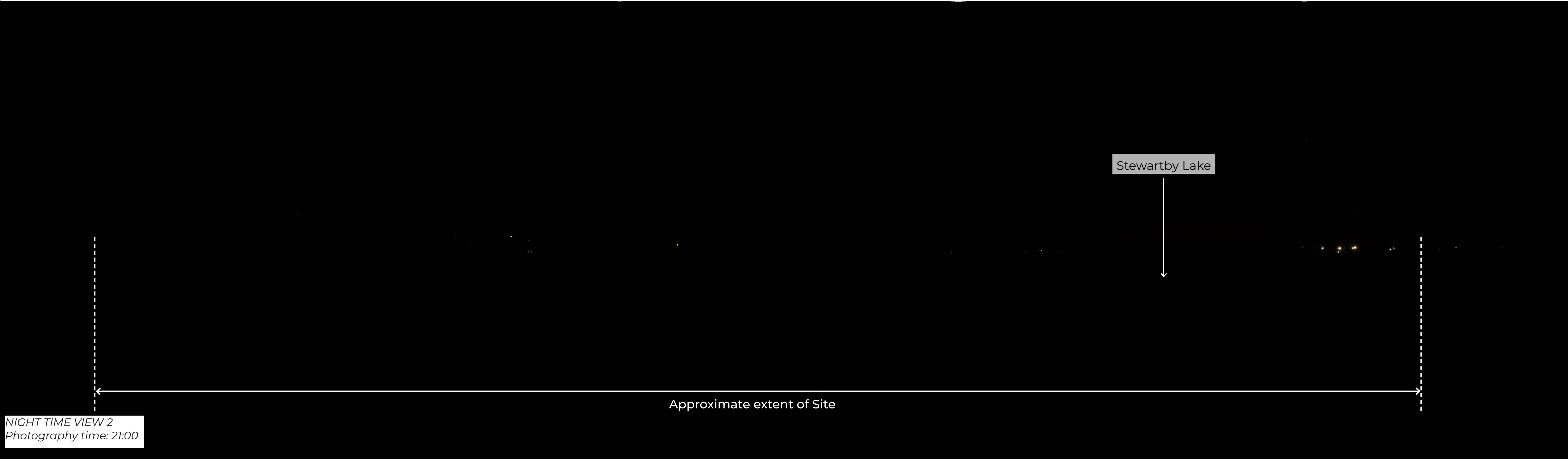
FIGURE 7.8 VIEW- POINT PHOTO- GRAPHY FOR INFORMATION