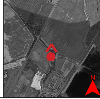
FIGURE 7.8 VIEWPOINT PHOTOGRAPHY