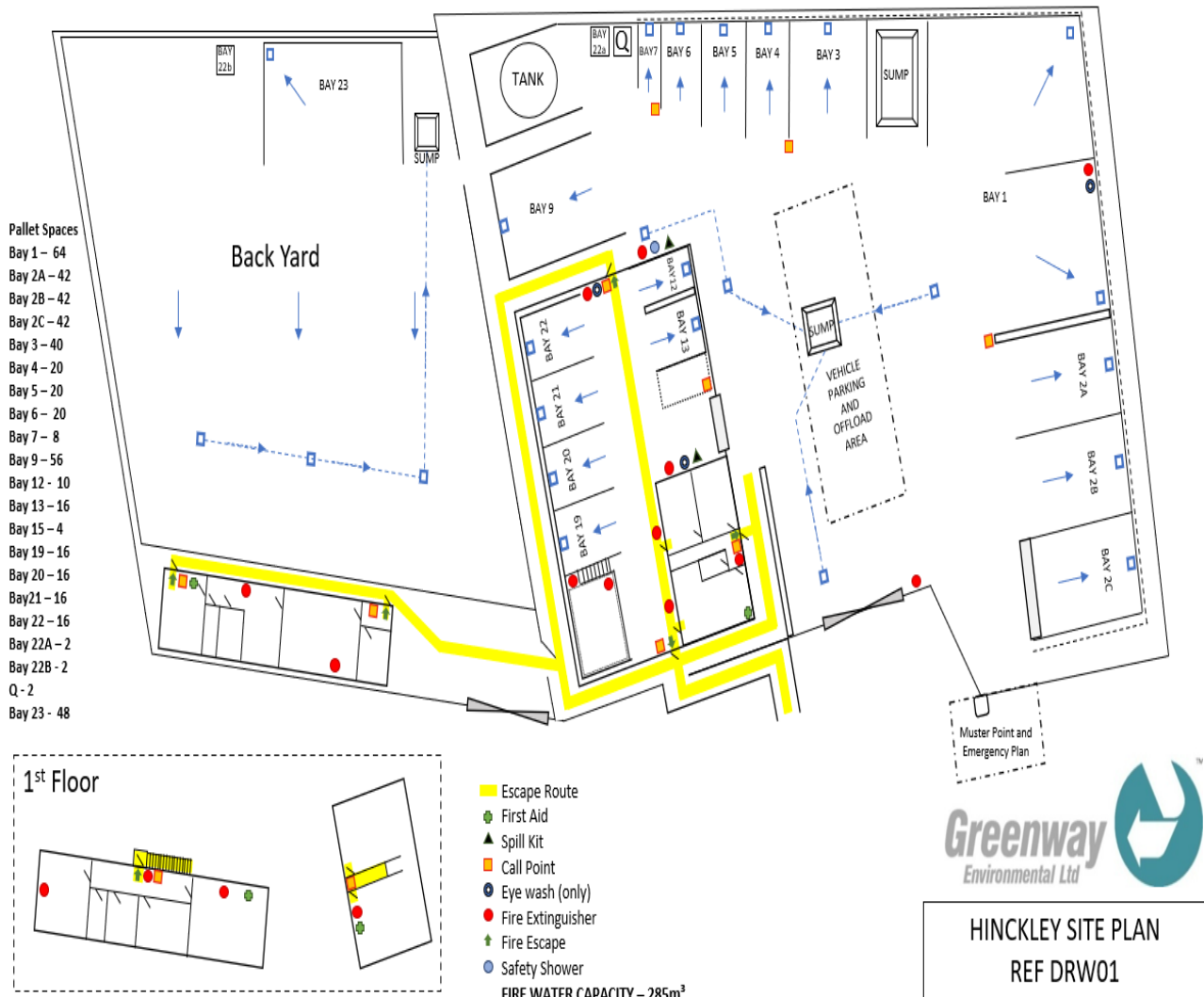
Figure 1: infrastructure plan