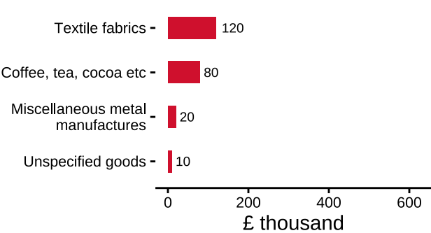
The top 4 UK goods imports, in the four quarters to the end of Q4 2024, from Cape Verde