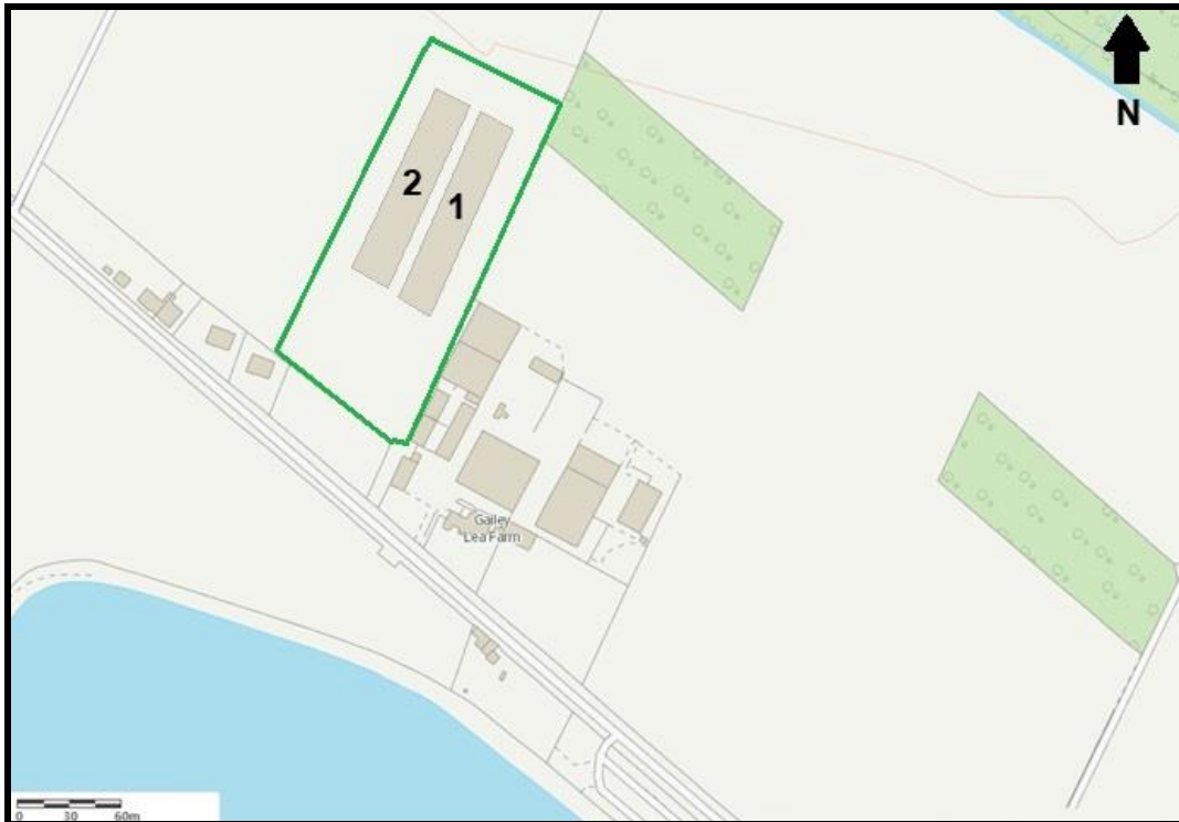
Site layout plan

Site plan - showing installation boundary as referred to in condition 2.2.1.