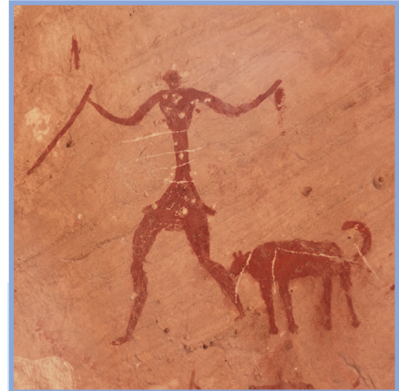
a picture on a cave wall

Today, many people keep animals as pets. If you have a pet, you have to look after it. However, did you know that some animals can look after their owners too?