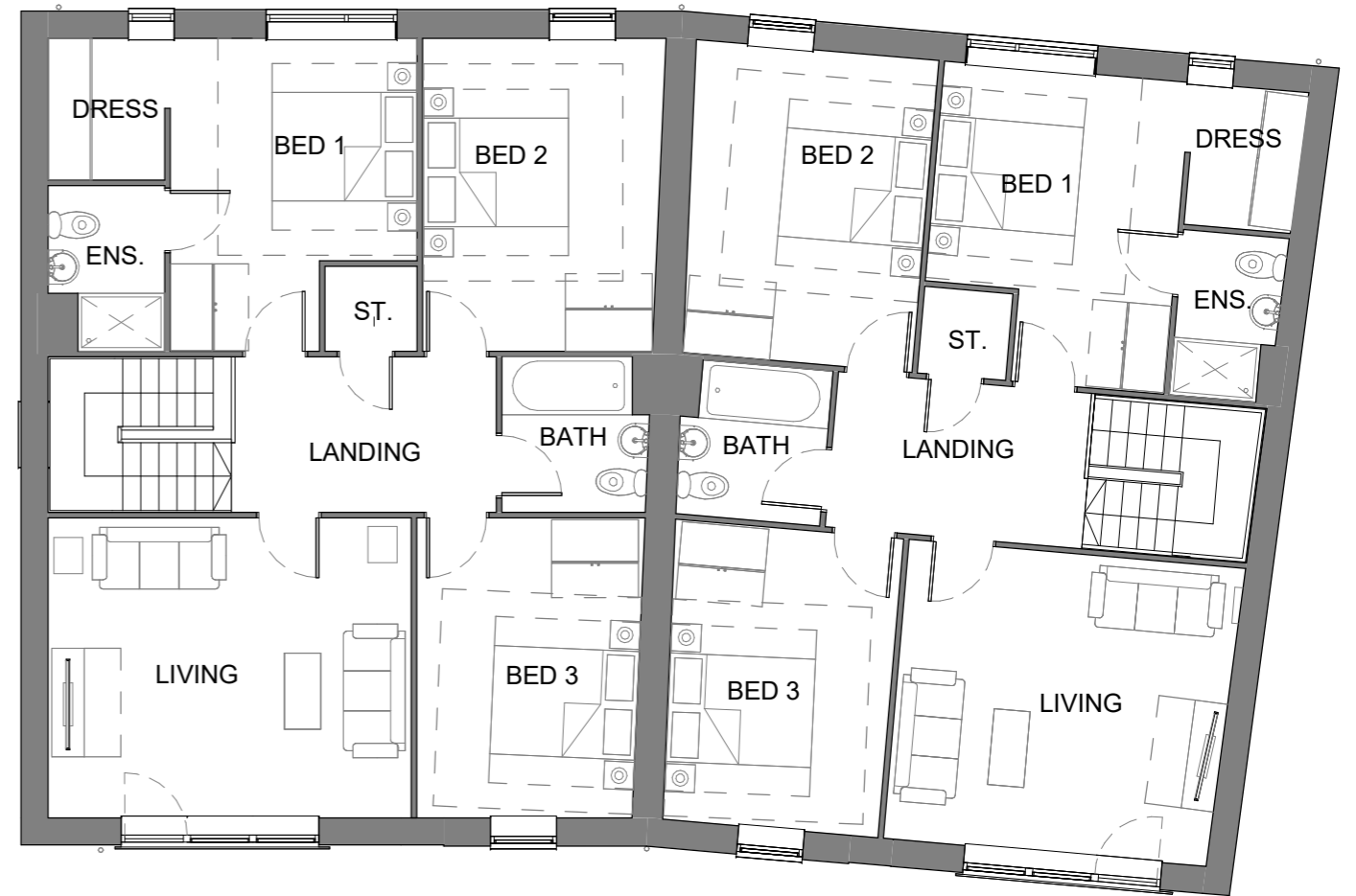
First Floor 1 : 100