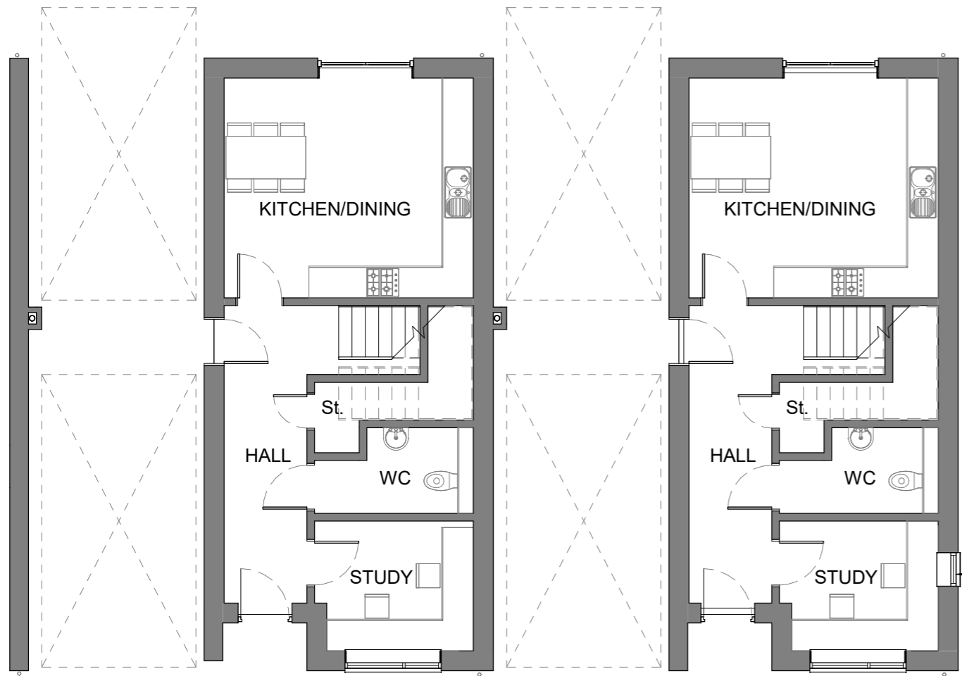
Ground Floor 1 : 100