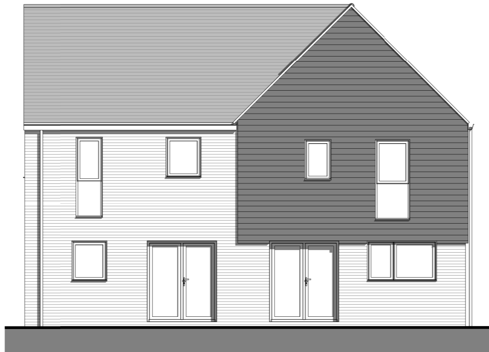
Rear elevation 1 : 100