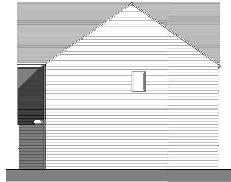
Right Elevation 1 : 100