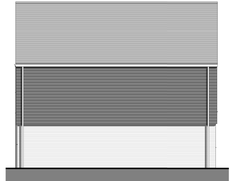
Left Elevation 1 : 100