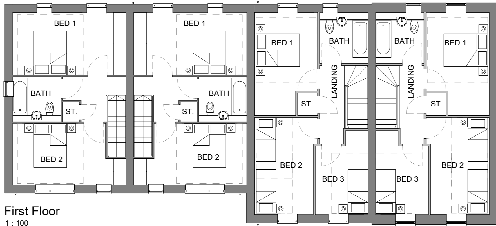
First Floor 1 : 100