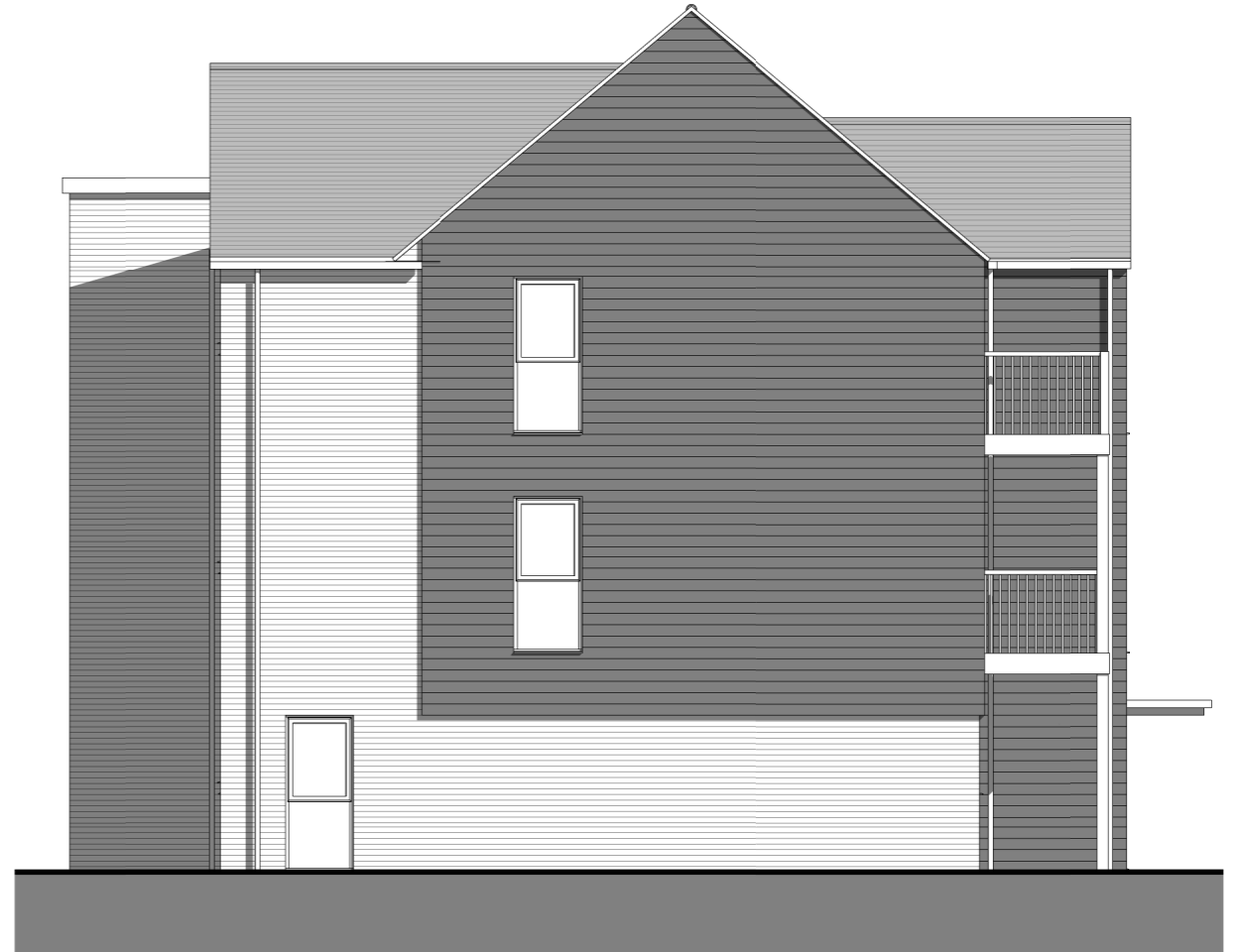
Side Elevation 1 : 100